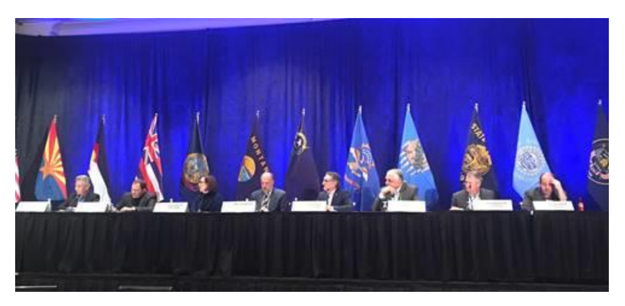
Governors at the WGA Winter meeting in Las Vegas from L-R: Hawaii, Utah, Oregon, WGA Staff, North Dakota, Nevada, Idaho, and Colorado. Not pictured: Arizona, Oklahoma and Montana.

I am pleased to announce our most recent partnership, the <u>Western Governors Association</u> (WGA). WGA represents the 20 states and territories west of the North Dakota/Minnesota line drawn south to include Texas.