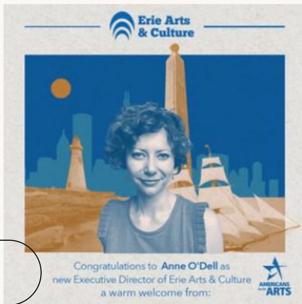
Alt Text: Image of a woman smiling, placed in front of a sail boat and buildings digital collage.

workforce programming Erie Arts & Culture to serve artists and culture bearers in the community. It was inspiring to speak to these new leaders! Keep an eye out on Americans for the Arts social media for more new leaders in the field. Have a new leader you want shared, just reach out.