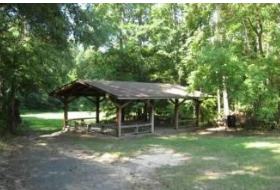
Existing picnic area