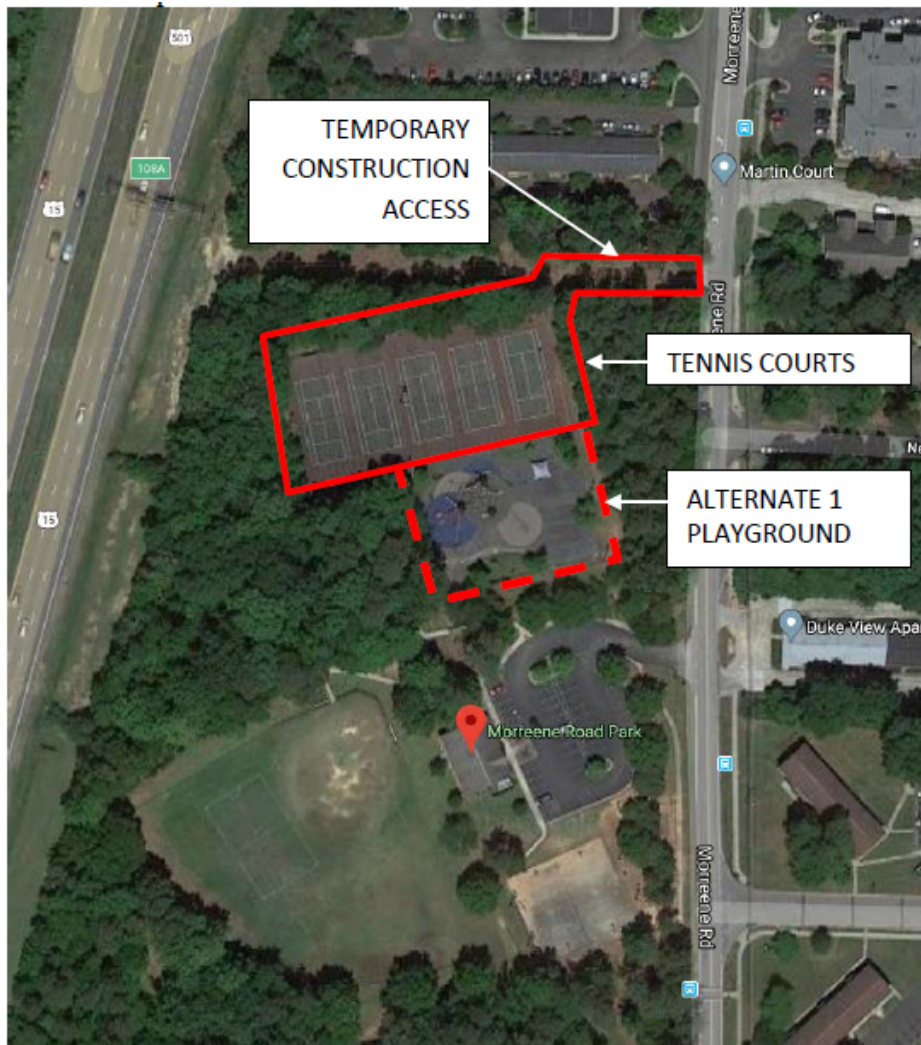
Aerial view of current site