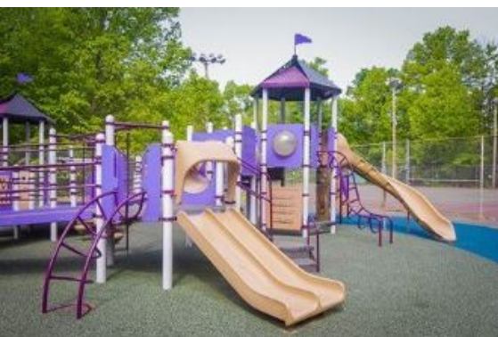
Existing ADA accessible playstructure