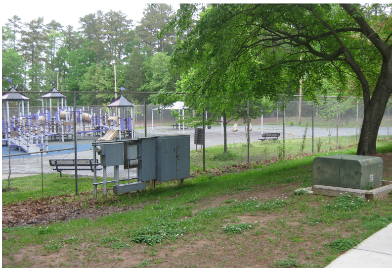
View of play structure from parking lot