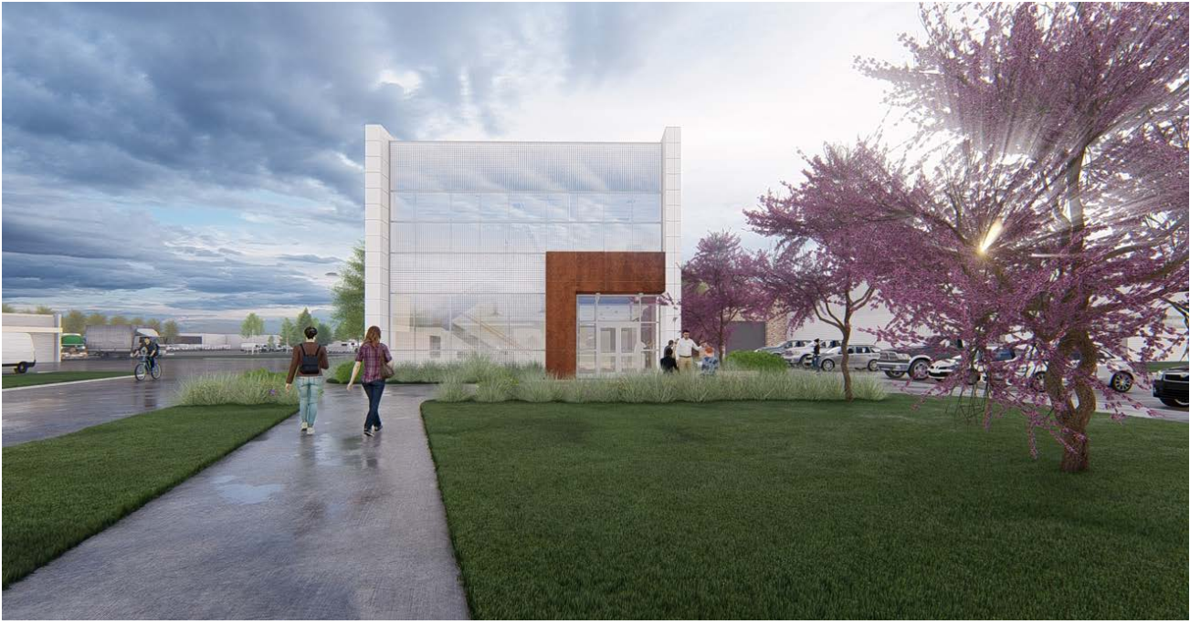
Johnson Family Equine Hospital, west entry, Architect's rendering