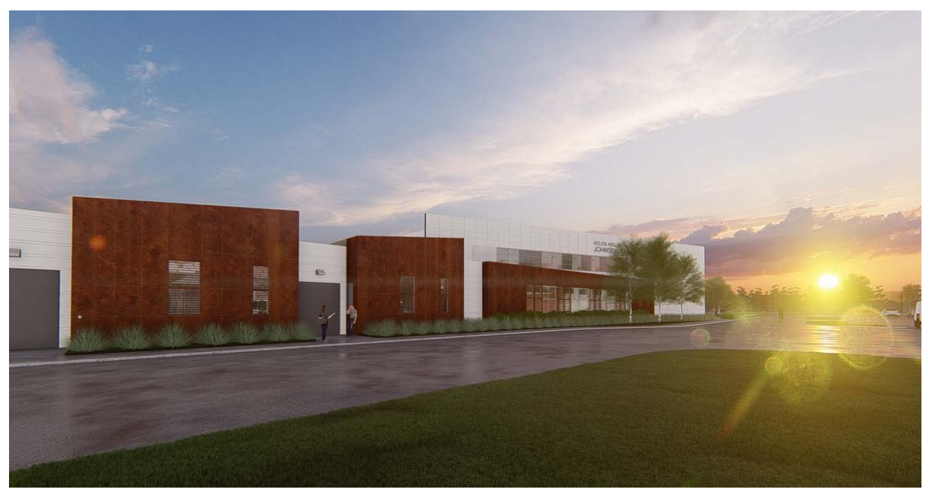
Johnson Family Equine Hospital, north perspective, Architect's rendering