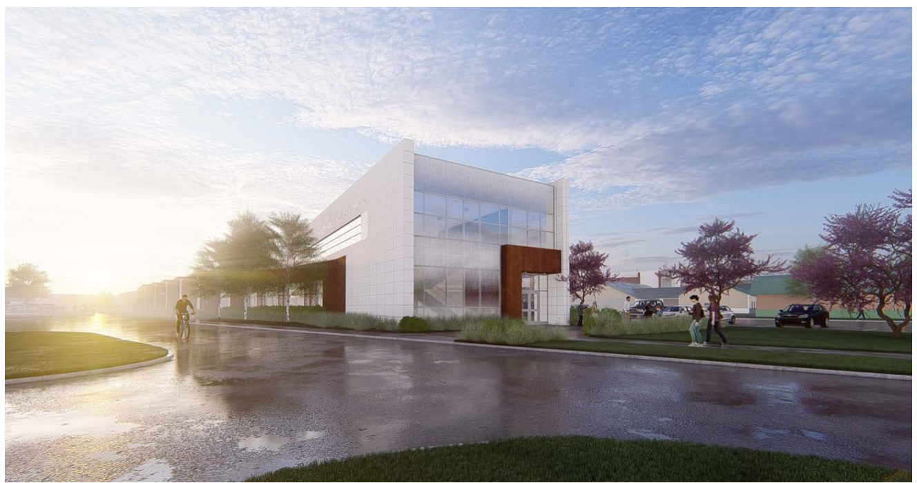
Johnson Family Equine Hospital, northwest perspective, Architect's rendering