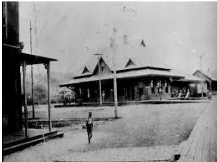
East Tennessee & Western North Carolina Depot: Early Years