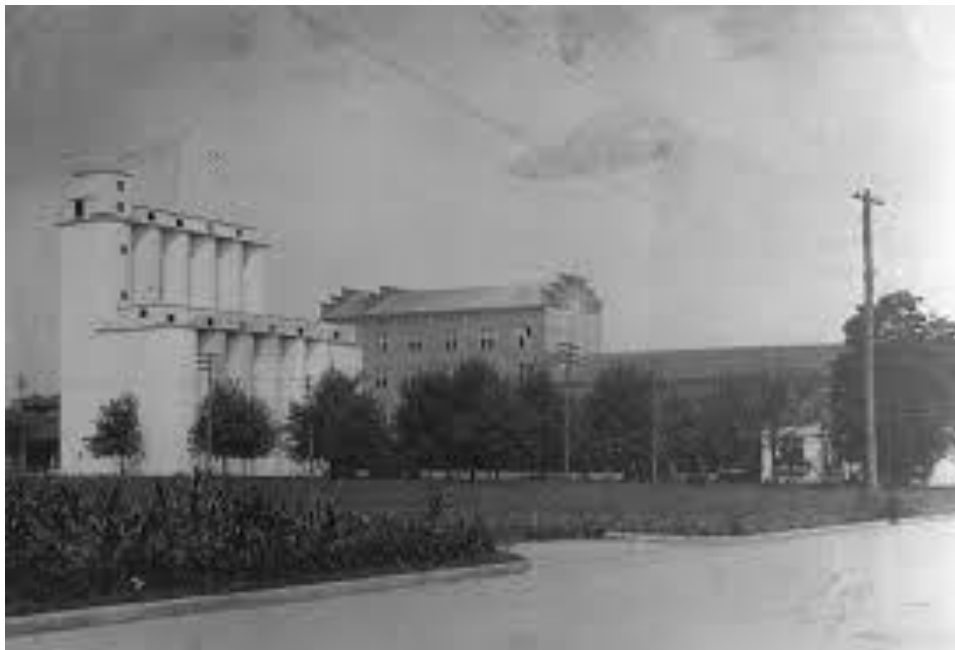
Model Mill: Early Years