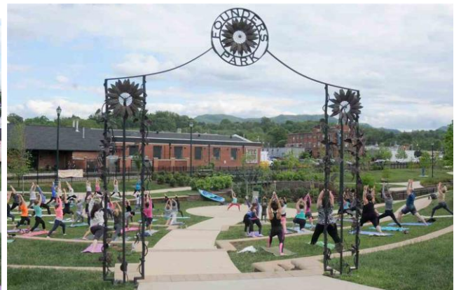
Barefoot in the Park Yoga