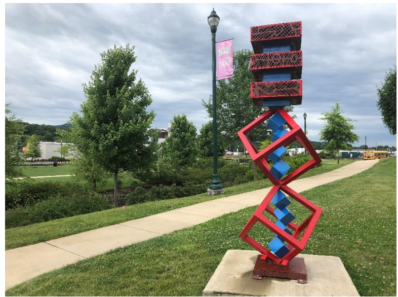
Biennial Sculpture Exhibition