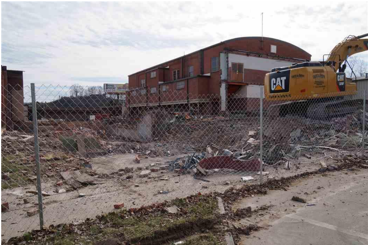
Langston School Reconstruction