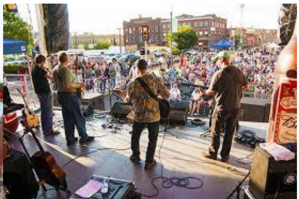
Blue Plum Festival