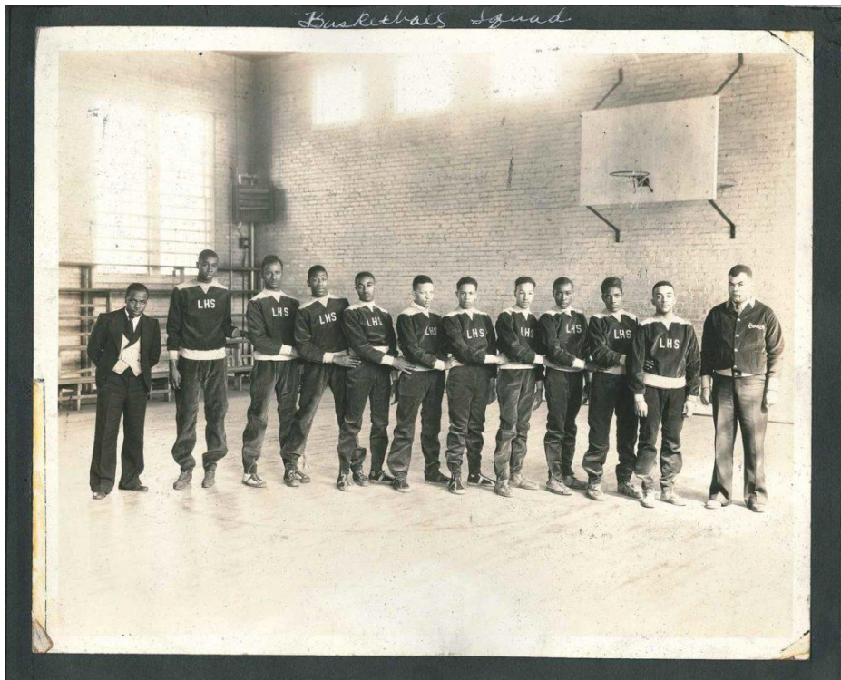
Langston Basketball Squad