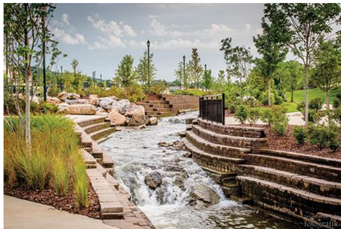
Brush Creek in Founders Park