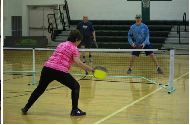
Memorial Park Community Center Activities