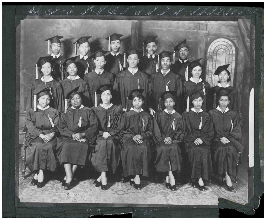
Langston Graduates - 1939