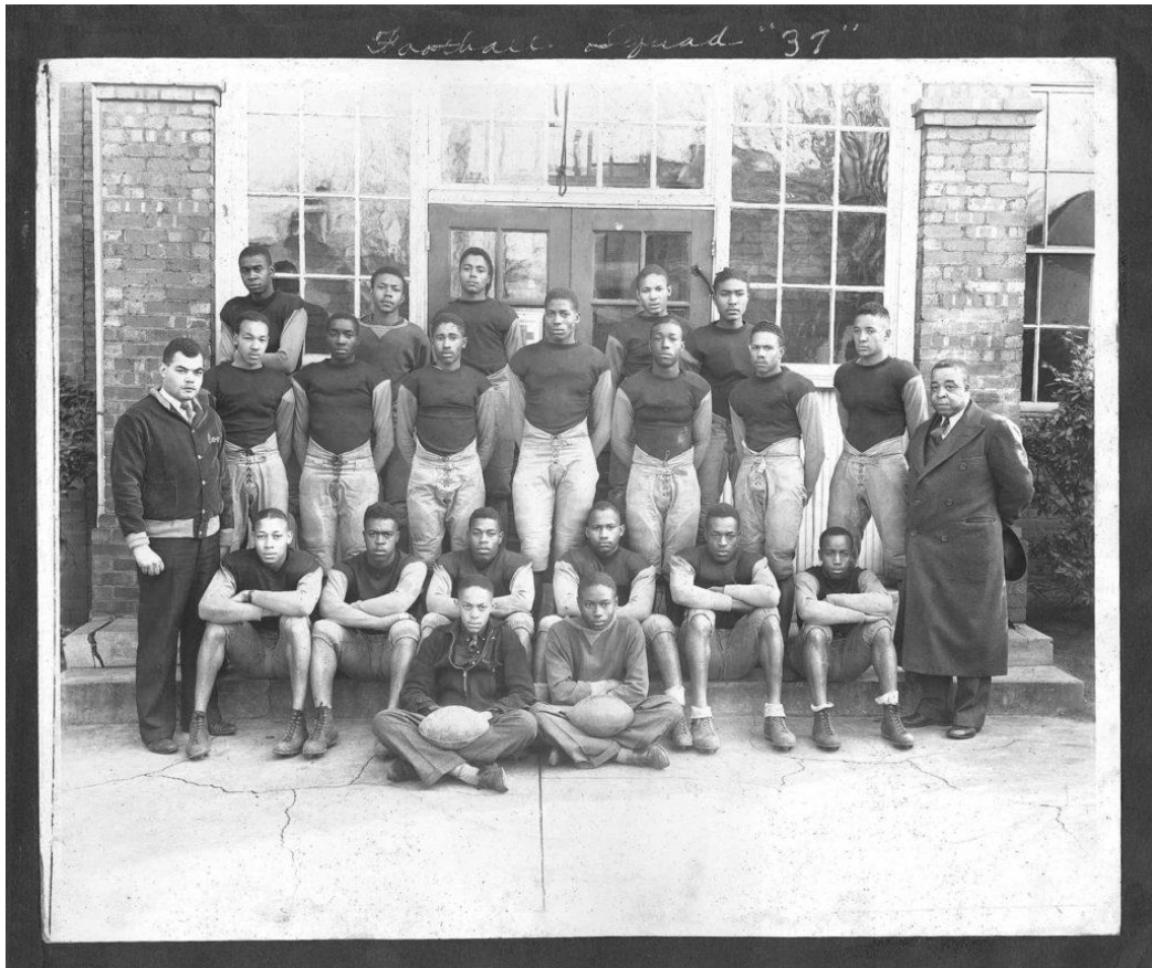
Langston Football Squad – 1937