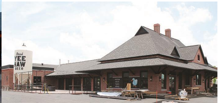
East Tennessee & Western North Carolina Depot: Present (Yee Haw Brewery)