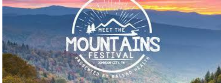
Meet the Mountains Festival