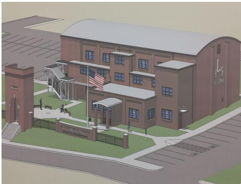
Rendering of the New Langston School Multicultural Center