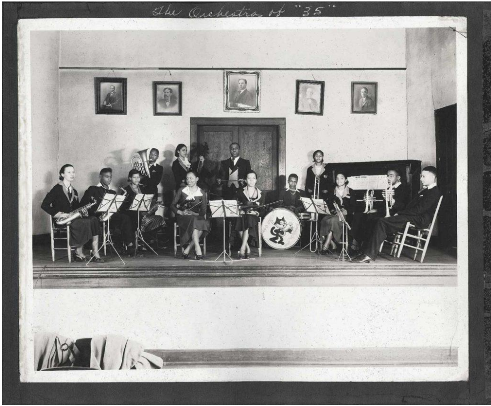
Langston Orchestra – 1935