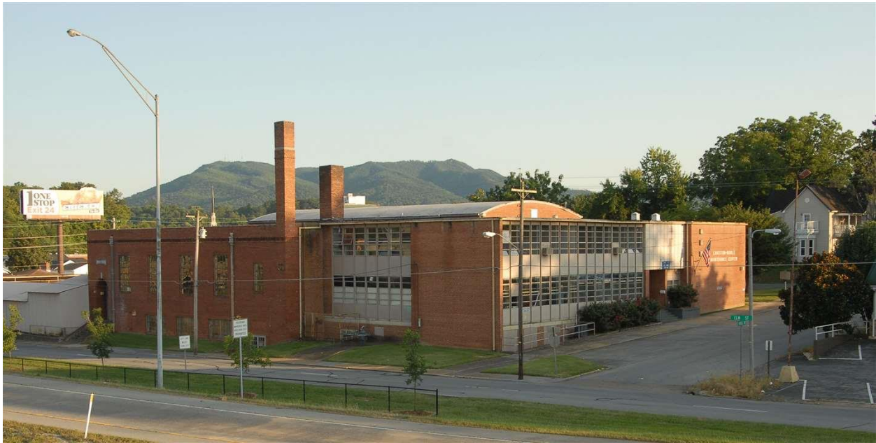
Langston School (Langston-Biddle Maintenance Center) - 2015