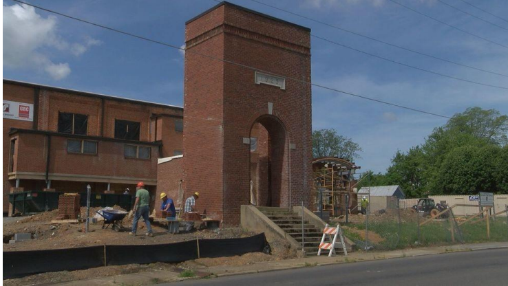
Langston School Reconstruction