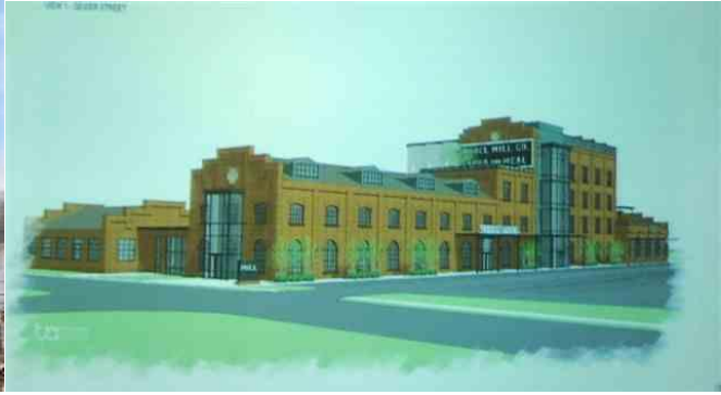
Model Mill: Present (left) Model Mill: Remodeled Rendering (right)