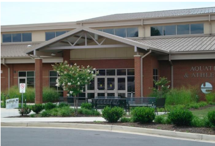
Memorial Park Community Center