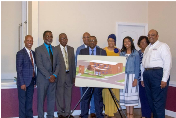
Advocates at Campaign Kick-Off Event for the New Multicultural Center