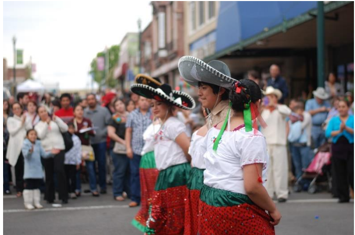
Corazon Latino Festival