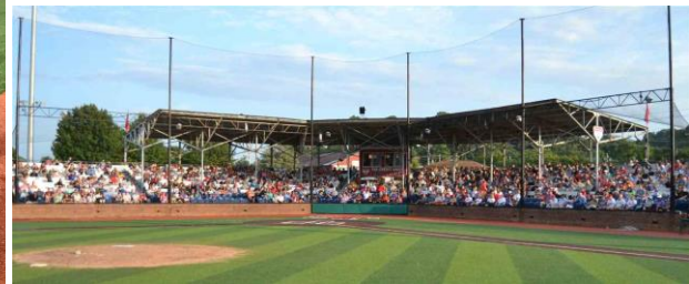
TVA Credit Union Ballpark