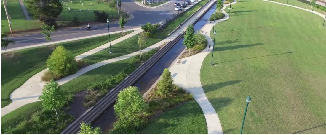
Founders Park Aerial