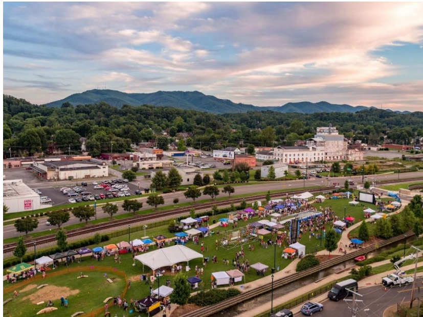
Founders Park Aerial (with festival)