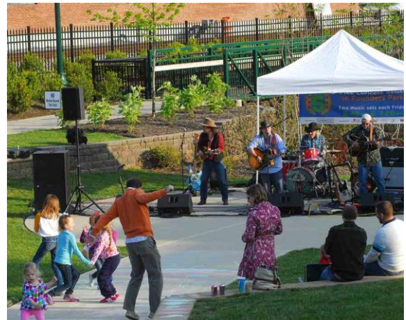
Founders after 5