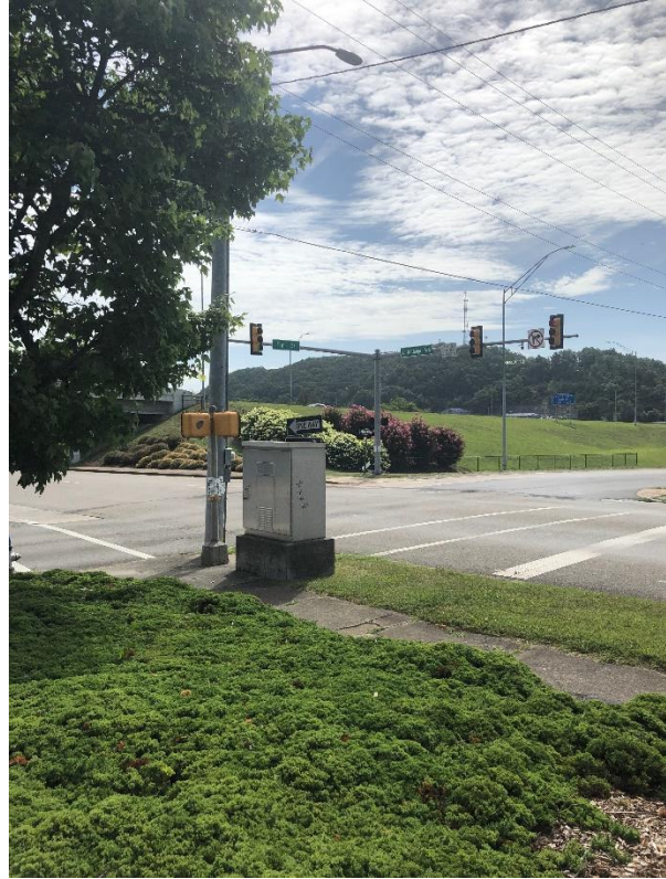
Access panel on control box is on the side that faces Elm St.