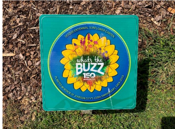
Pollination Corridor (pockets of native, pollinator-friendly landscaping are located between downtown Johnson City and East Tennessee State University)