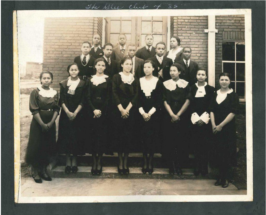
Langston Glee Club - 1935