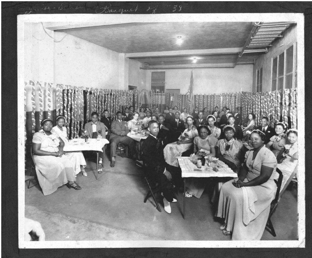
Langston Banquet - 1938