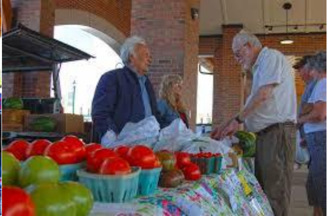
Farmers Market at the Pavilion by Founders Park