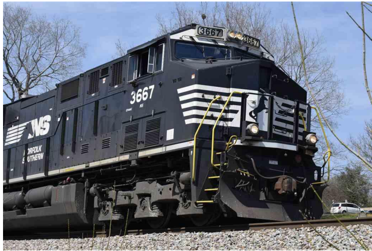
Norfolk Southern Train

Access panel on control box is on the side that faces away from the main street (State of Franklin Rd.).