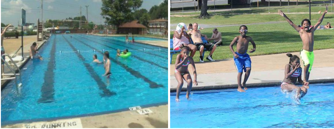
Legion Street Pool