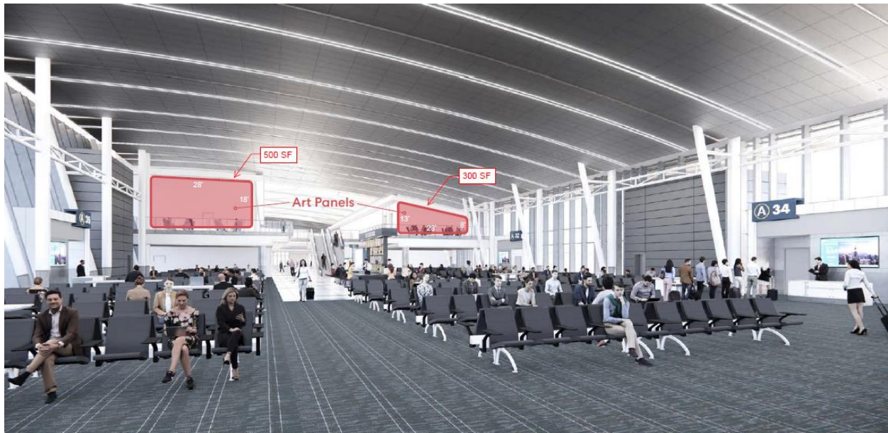
MEZZANINE VIEW LOOKING WEST [Fig. 6]