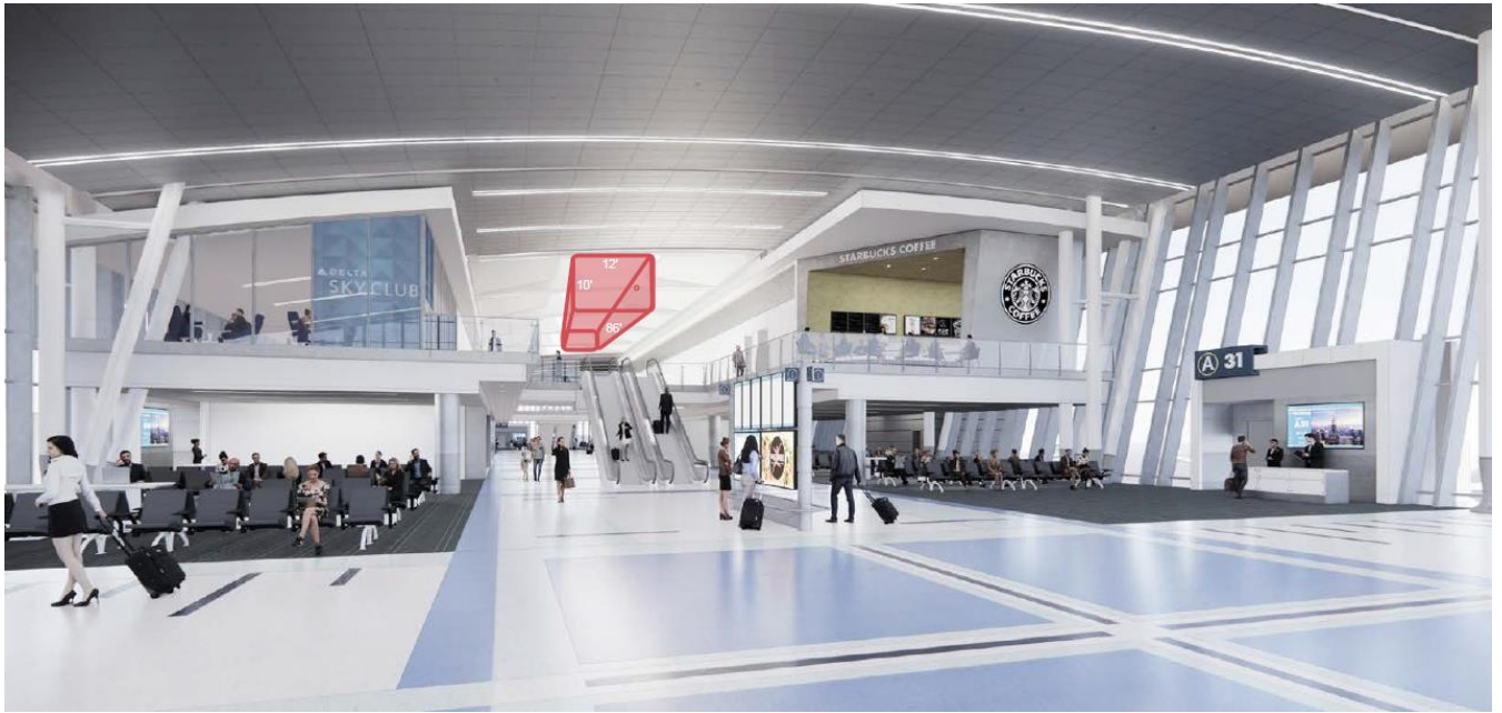
MEZZANINE VIEW LOOKING NORTH [Fig. 4]