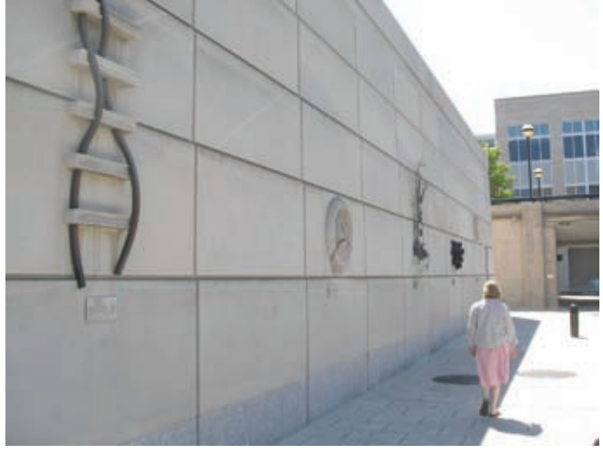
US 1.5.1: Walls and facades of the Indiana State Museum incorporate artwork from every Indiana county and help transform an otherwise monolithic wall into a site amenity.