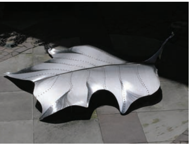
US 1.5.2: The Indiana Government Center incorporates several pieces of public art in its buildings and on its campus. Large projects like this are encouraged to incorporate public art.