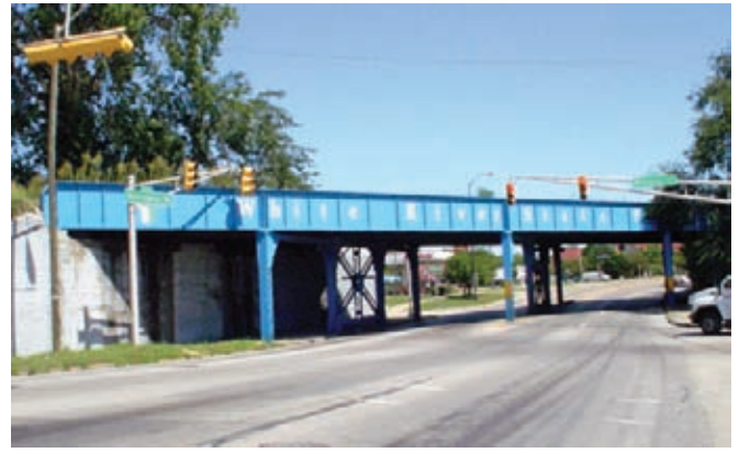
US 1.4.2: This railroad bridge over West Washington Street at Harding Street has been transformed into a gateway to White River State Park with unique painting.