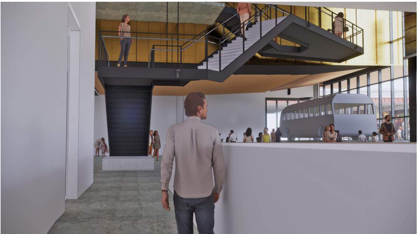
VIEW OF STAIR FROM RAMP