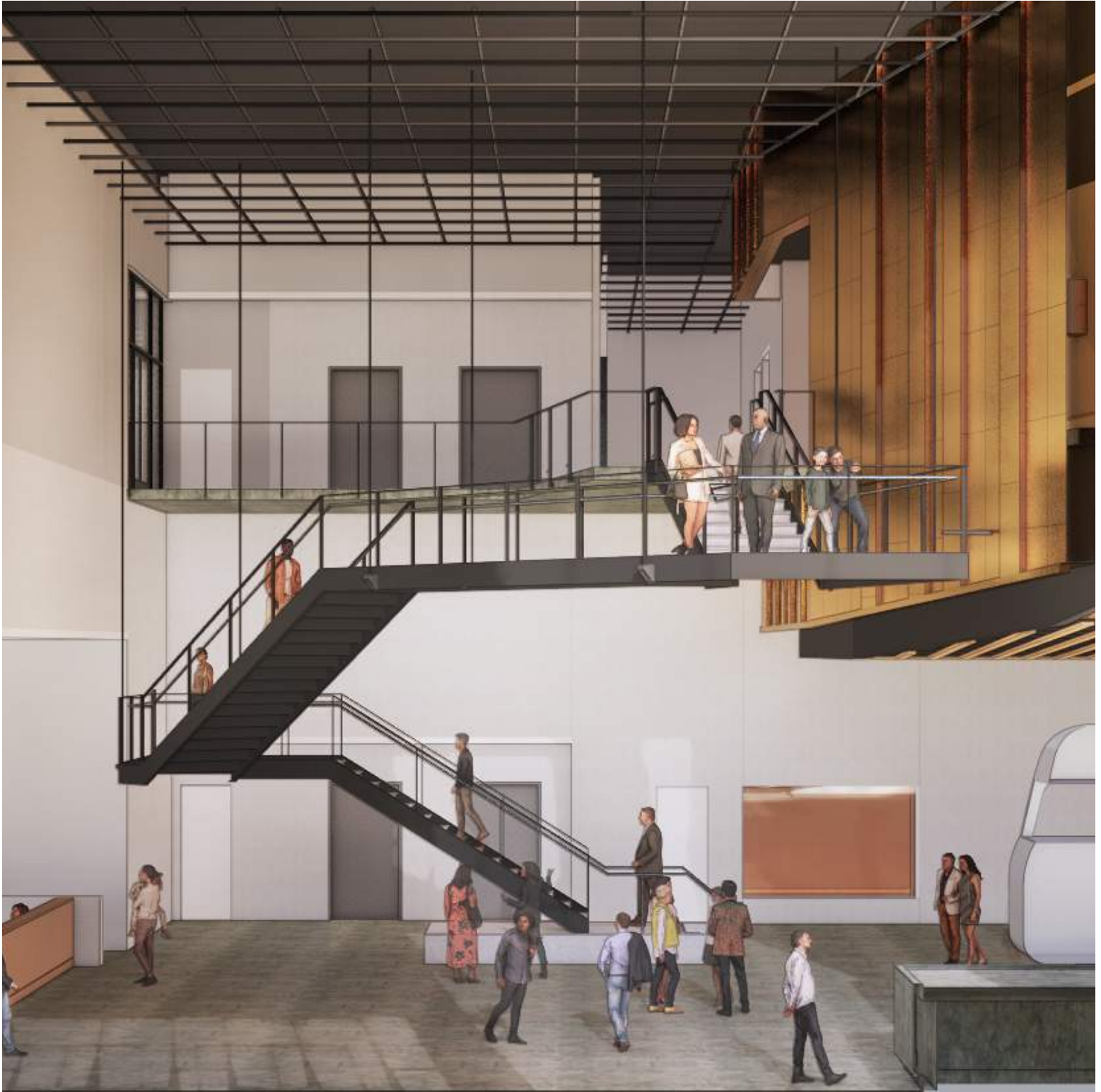
OVERALL VIEW OF MAIN STAIR