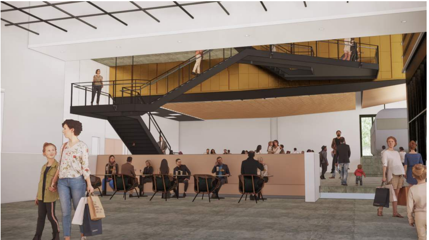
VIEW OF STAIR FROM RETAIL