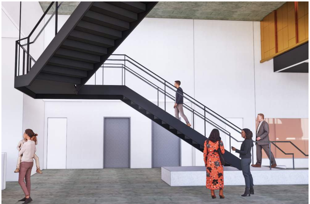
VIEW OF LOBBY FROM FRONT ENTRY