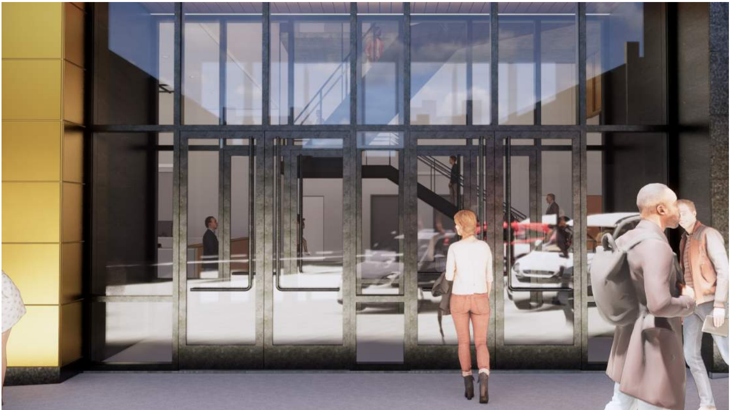
OKPOP_Stair #1 and Lobby Views for Art in Public Places