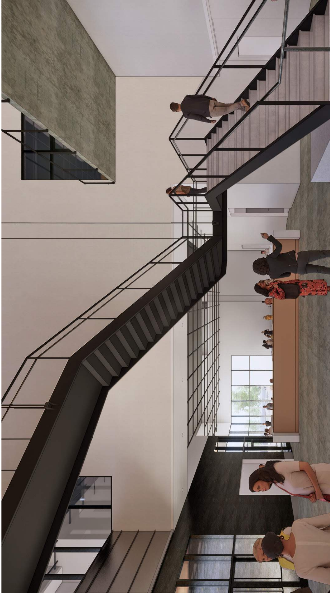
OKPOP_Stair #1 and Lobby Views for Art in Public Places