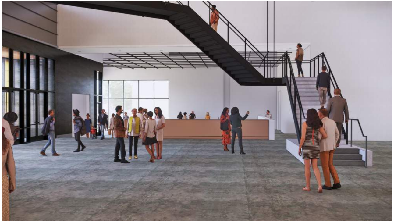
VIEW FROM TEMPORARY GALLERY