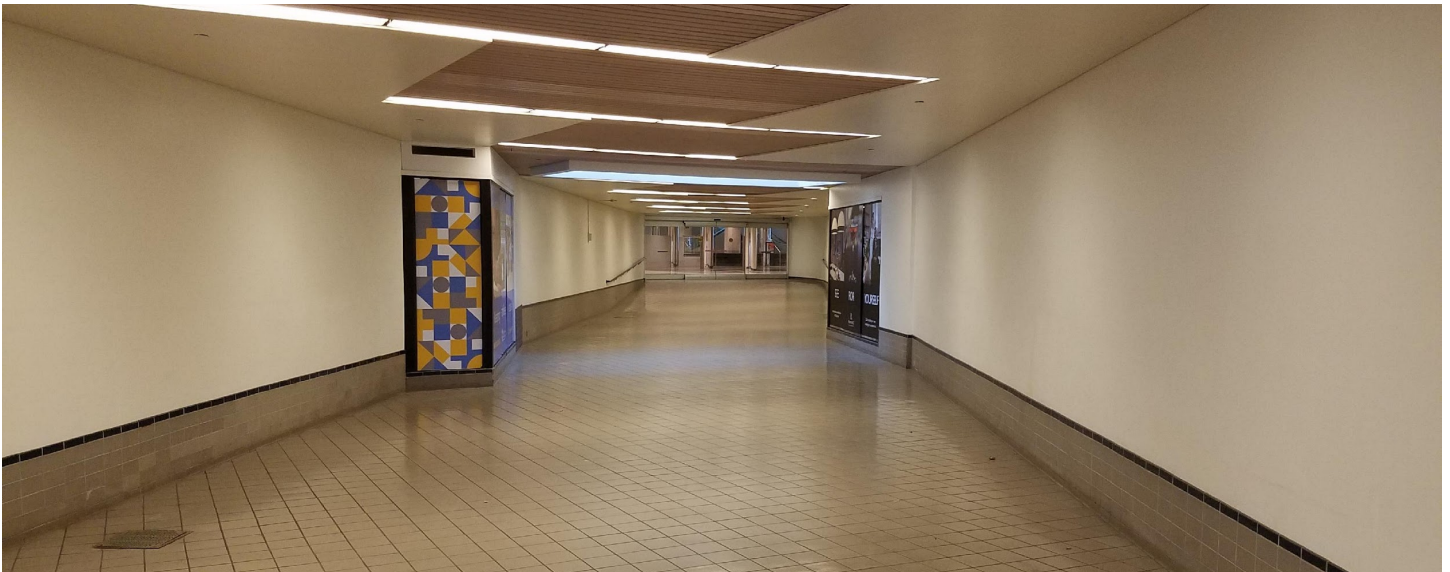
PHASE 1: Vistula Garage Connector