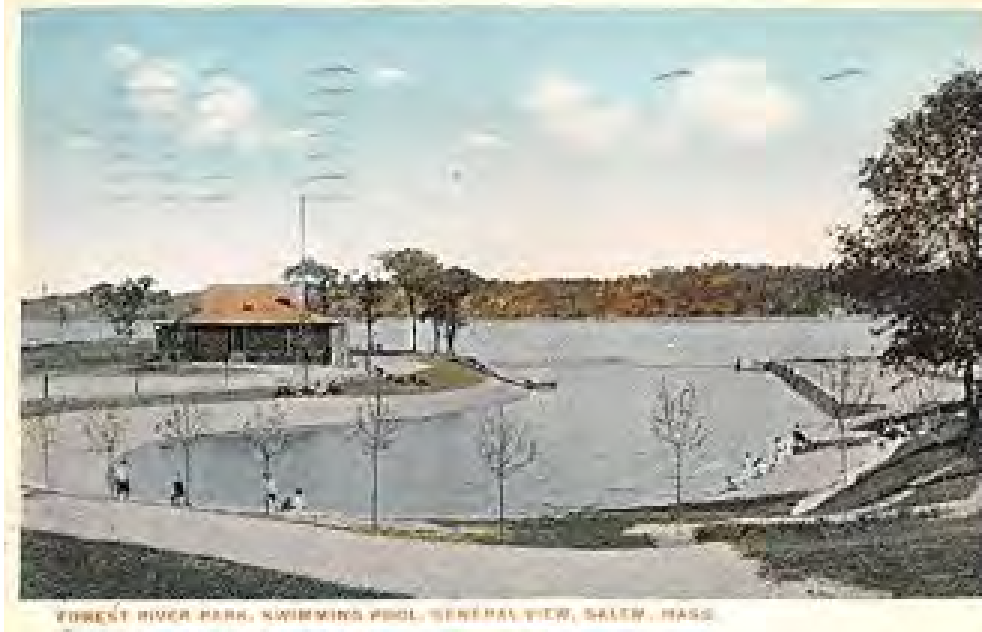
Undated postcard of the old bathhouse at Forest River Park, likely ca. 1920. Original tidal pool as designed in early 1900s