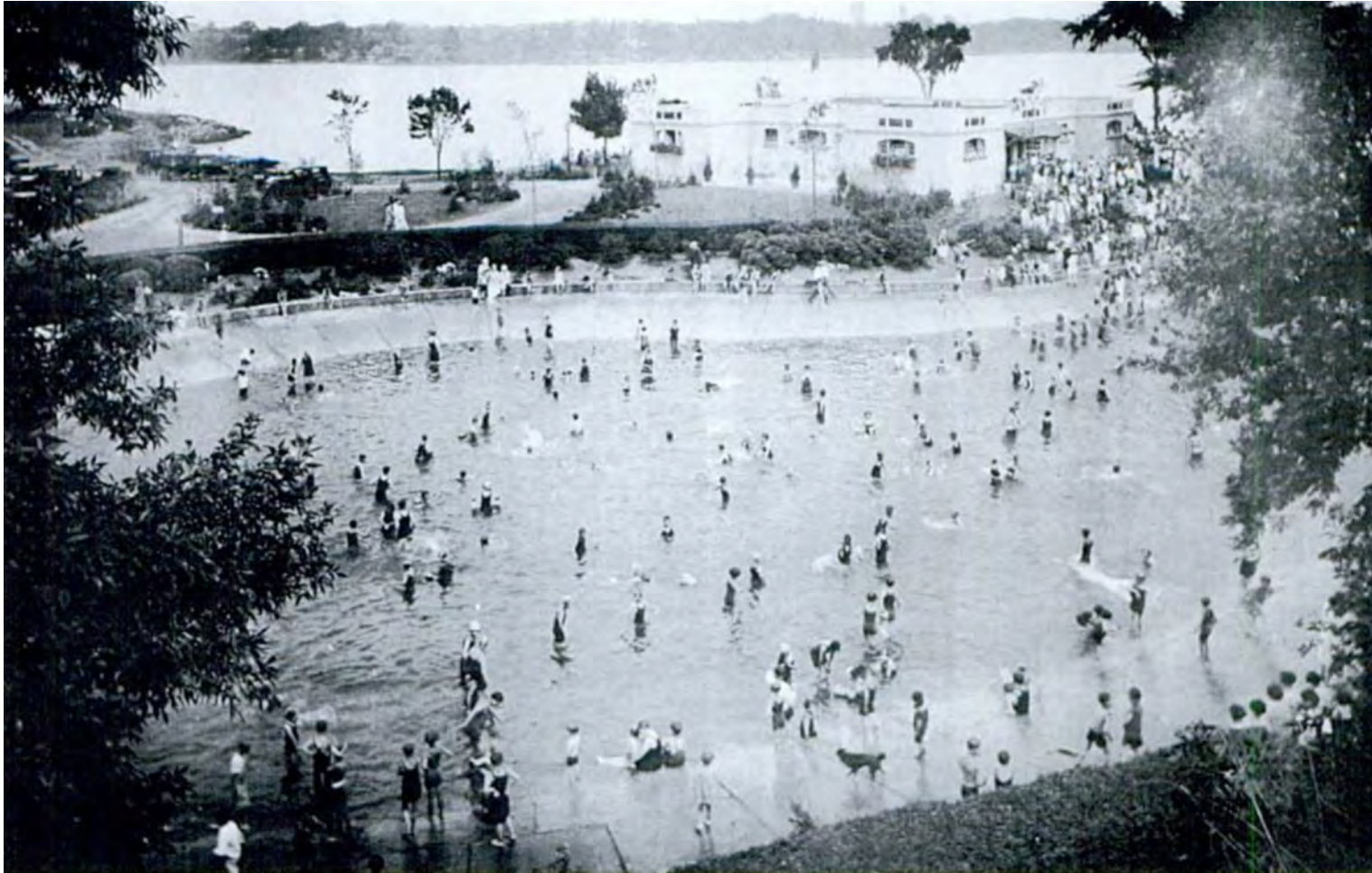
Undated photograph of the bathhouse at Forest River Park, likely dating to the late 1920s.