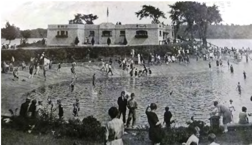
Undated photograph of the bathhouse at Forest River Park, likely dating to the late 1920s. Summer day at the Forest River Pool on the banks of Salem