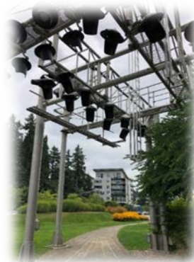
Seattle Region.

distance of the station and to the five-mile walking and biking public art loop which features 32 public art installations. The walkshed public art is concentrated in two parks located on either side of Cleveland Street, which in 2019 was named by the American Planning Association as a Great Street, for its outstanding urban design and placemaking. A public art map is available online, and as a hard copy brochure for trail users. The map proclaims that “Art links people to their city to each other, to create a truly sustainable, soulful and imaginative community.” 14