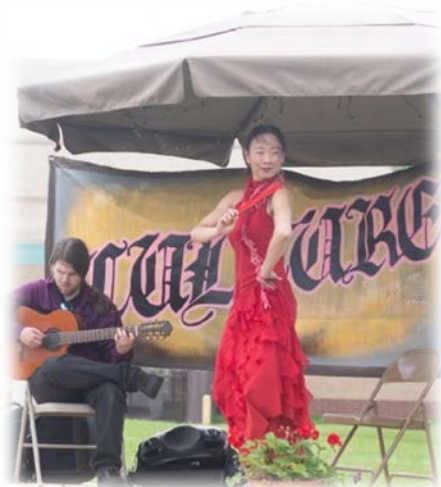
Minneapolis-Saint Paul region.

Lessons learned from Irrigate have since been applied in the planning for the region's Green and Blue Line extensions. During the early planning stages of the Blue Line extension,