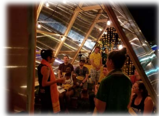
Minneapolis-Saint Paul region.

As noted in the previous theme there is considerable awareness in our case study regions that new development near transit stations can be both a benefit and a threat to existing neighborhoods. The combination of improved transit, new amenity-rich public spaces, and the addition of new market-rate real estate projects too often leads to rent and land value increases, which threatens to displace the lower-income residents who are most transit-reliant, as well as small area businesses. Again, while not a solution to the larger issue of housing and workspace unaffordability, creative placemaking is being employed as an engagement tool aimed at bringing about a more holistic discussion about neighborhood change and the impacts of rail transit development.