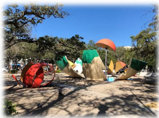
Miami region.

The Underline case study in the Miami region is also notable. This linear bicycle/pedestrian trail, park, and public art gallery – in progress beneath the elevated Metrorail line – was initiated and continues to be guided by philanthropically oriented civic leaders in an ongoing public-private partnership. Miami-Dade County’s role has been to develop the infrastructure for the ground level intermodal mobility corridor that will connect eight of Metrorail’s stations to neighboring communities and the 10-mile trail itself. While The Underline is envisioned as “the most accessible public space in all of Miami” and the nonprofit Friends of The Underline endeavors to make that vision an even bigger arts and cultural asset. Miami-Dade County had previously funded some public art in relation to the station areas but the continuing creative placemaking effort in conjunction with the trail’s development will be donor funded.