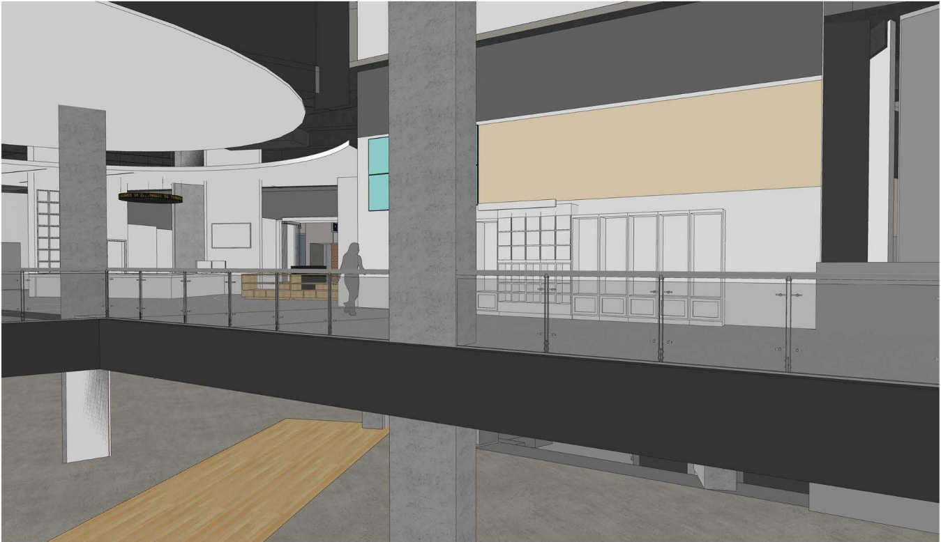
NORTHWEST MAIN CONCOURSE AT TEAM STORE INTERIOR