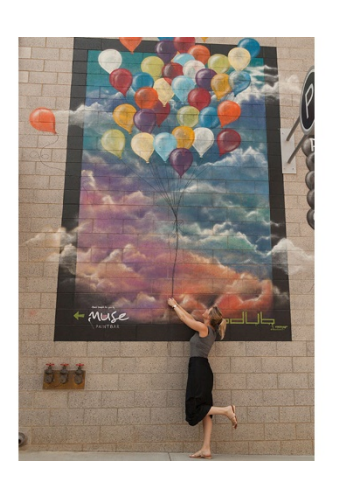
Mosaic District, VA