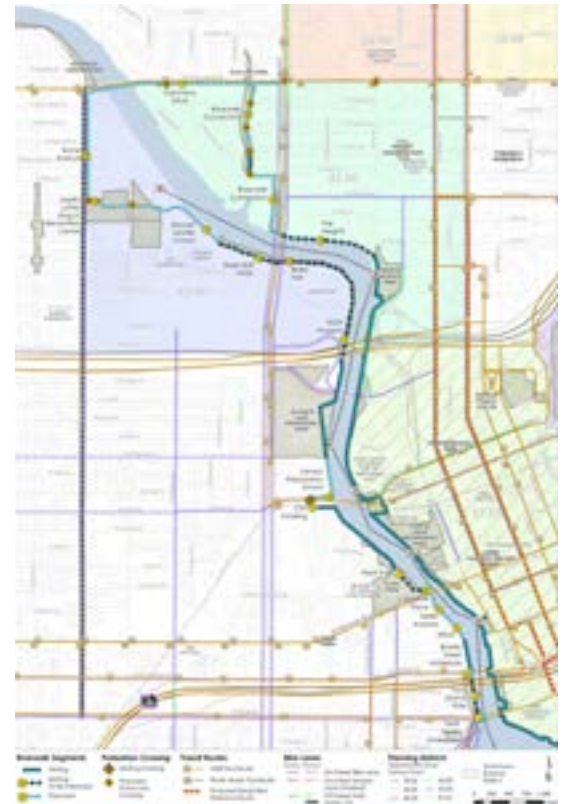
West Riverwalk Proposal

Estimated Budget Ranges: $15,000 - $100,000