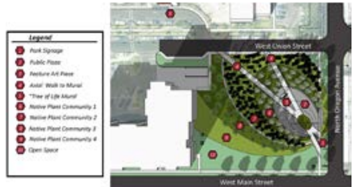
West River Pocket Park: Sculpture Garden Park