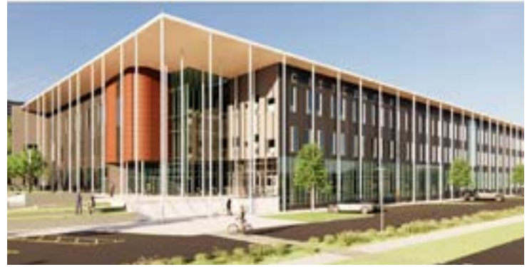
Rendering of The City Center at Hanna Ave.

The City of Tampa is constructing a government services facility on the vacant property at 2515 East Hanna Avenue. The City Center at Hanna Avenue will be a state of the art, LEED Silver building. It will house employees from seven City departments – Development and Growth Management, Logistics and Asset Management, Neighborhood and Community Affairs, Planning, Purchasing, Technology and Innovation, and the Plan Review Division of the Tampa Water Department.