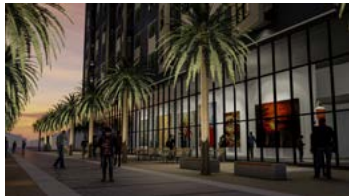
West River Redevelopment, rendering of Art Walk Corridor