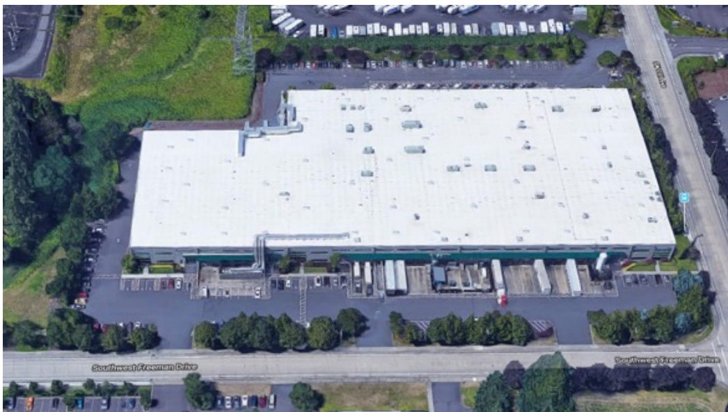
Aerial view of North Valley Complex prior to renovation, looking north.

Multiple state agencies will be housed within the North Valley Complex and will make use of the building for offices, laboratories and warehousing; including the Departments of Agriculture, Administrative Services, Operations and Management, Occupational Safety & Health and Emergency Management.