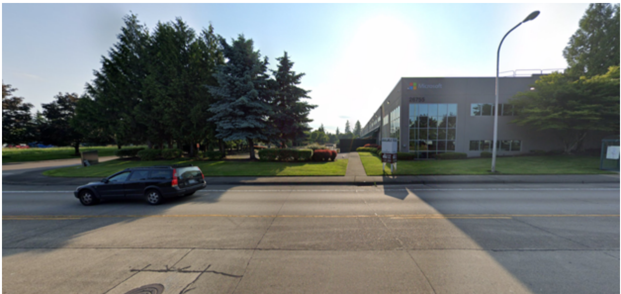
Site C. SW 95 th Ave, Wilsonville, Oregon.