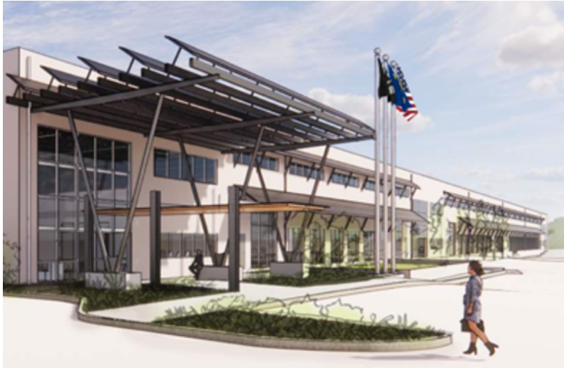
Rendering of the new main entrance to the North Valley Complex, the southwest corner of the building (Sera Architects).

The North Valley Complex project involves the renovation and upgrade of an existing 175,600 square foot, single-story concrete, tilt-up building with an interior mezzanine and associated site improvements.