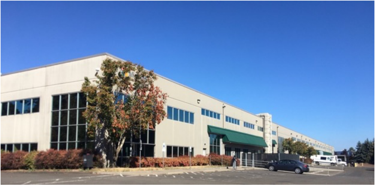
Site B. Photo shows the south-facing side of building prior to renovation. Site B's approximate location will be in the parking area adjacent to the green awning.