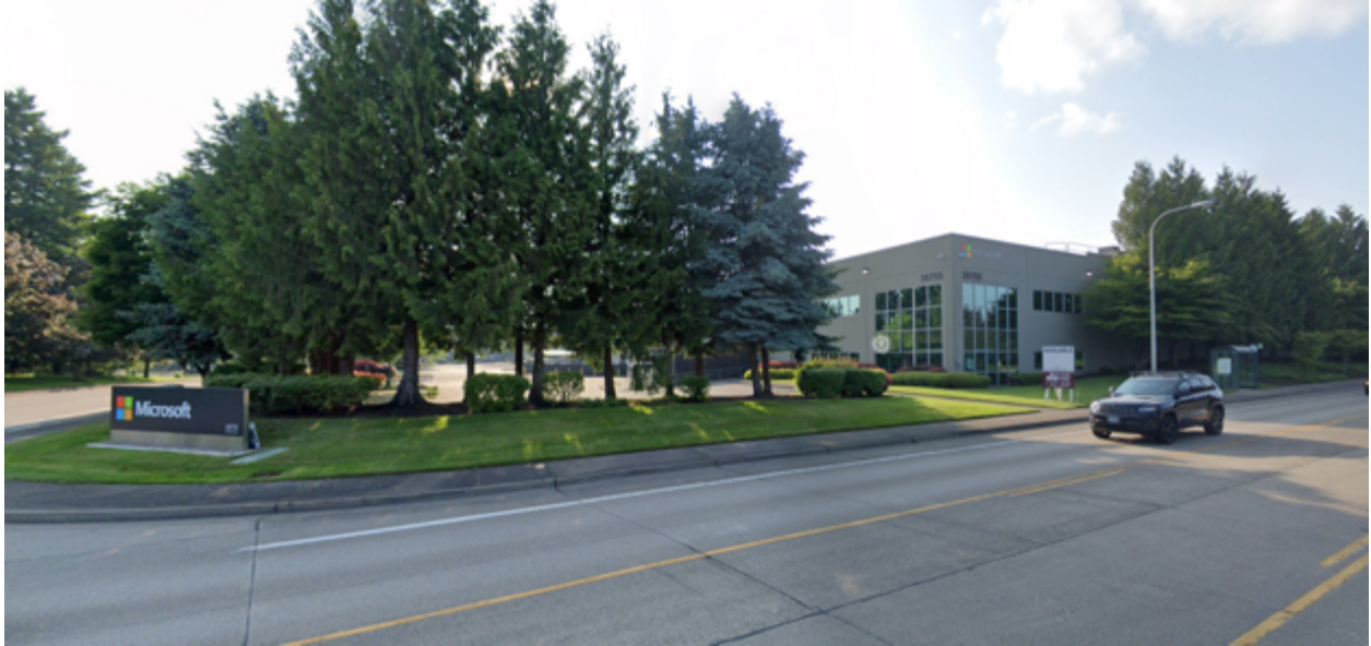
Site C. the SW 95 th side of the project. Artists may consider the landscaped area adjacent to the southeast side of the building or the façade of the building itself.