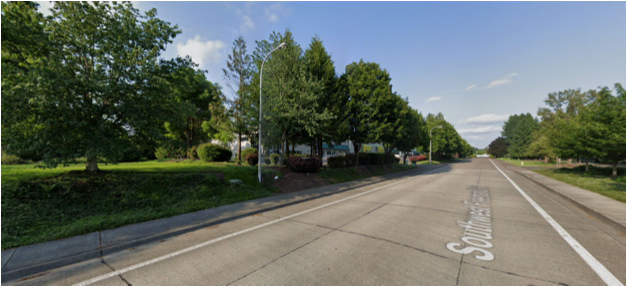
Site A. This photo is from Google Street View, taken on SW Freeman Drive looking northeast toward the greenspace with the building in the distance.