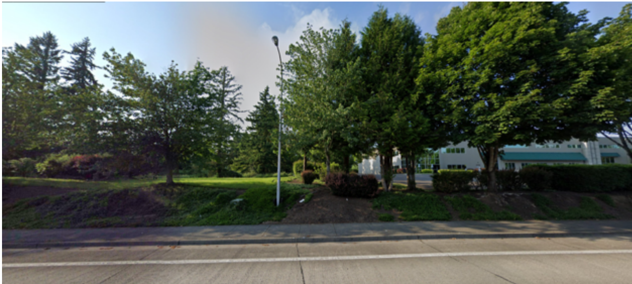
Site A is located adjacent to the SW corner of the parking lot. It is a greenspace not far from a small creek. This photo is from Google Street View, taken on SW Freeman Drive looking north to the site. North Valley Complex can be seen in the distance to the right.