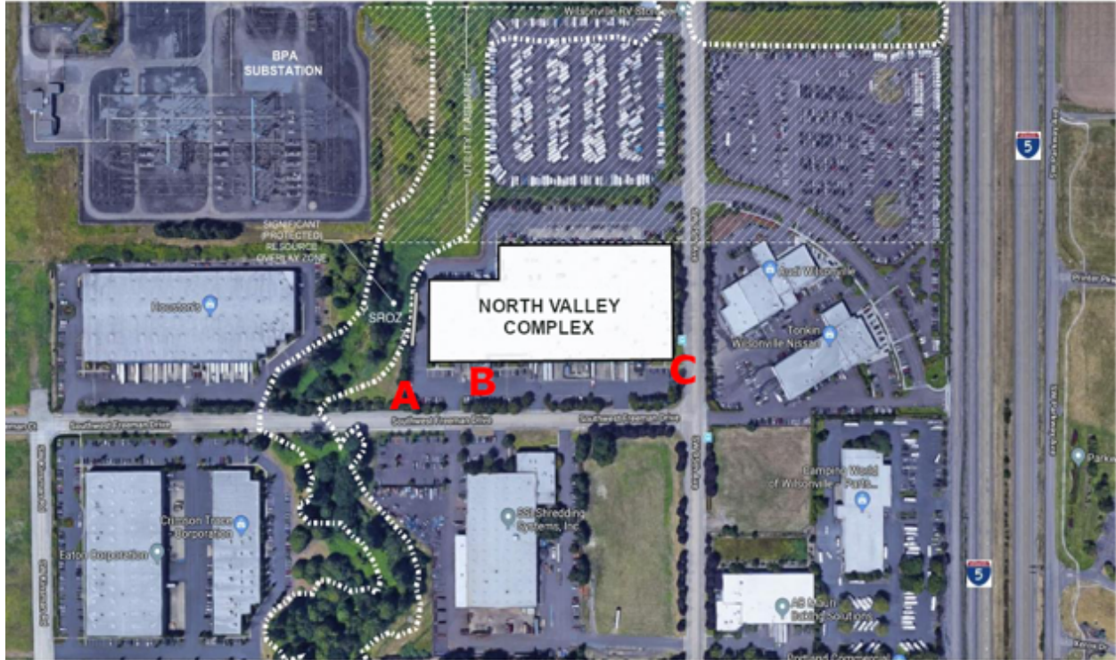
Aerial view of building and surrounding area with art locations noted. Interstate 5 is to the east.