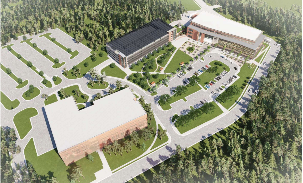
Concept Rendering Health & Human Services Campus

DEADLINE FOR SUBMISSIONS 2:00PM(EST), Wednesday, June 22nd, 2022