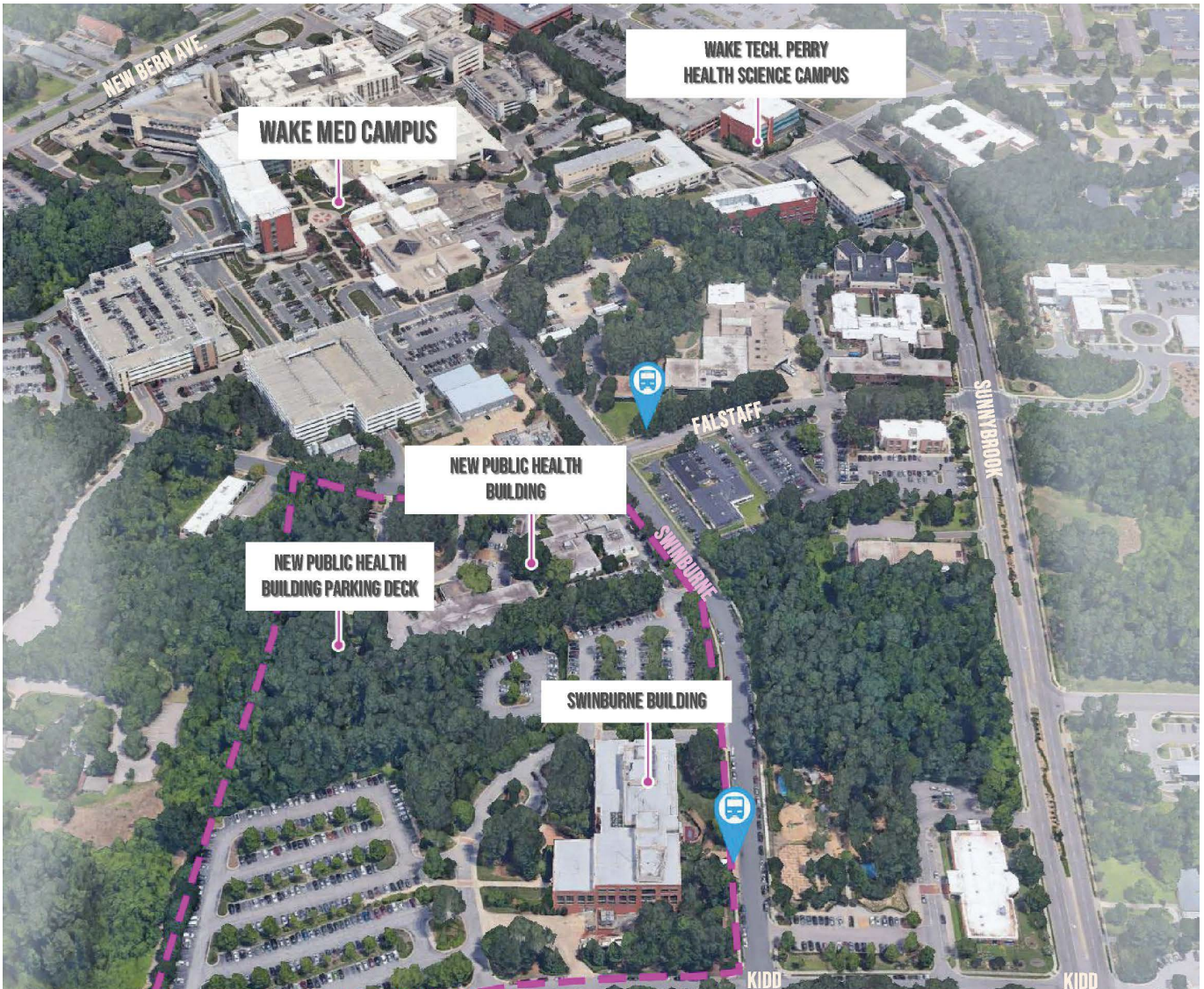
EXHIBIT #1 – SITE LOCATION HEALTH & HUMAN SERVICES CAMPUS