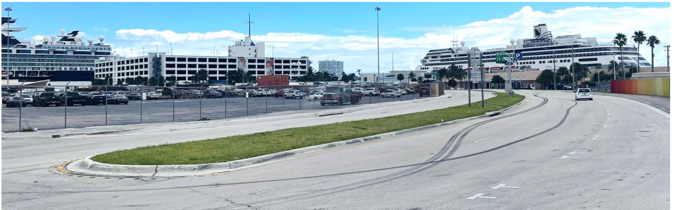
Site for artwork

Located in the heart of Greater Fort Lauderdale and the City of Hollywood, Port Everglades is one of the busiest cruise ports in the world. It is a leading container port in Florida and among the most active cargo ports in the United States. It is South Florida's main seaport for receiving petroleum products including gasoline and jet fuel. A foreign-trade zone and available office space inside the Port's secure area, makes Port Everglades a highly desirable business center for world trade. Port Everglades values public art for its ability to welcome cruise guests, build character and identity that is shared by tourists, the Port's workforce, and the local community. More than 50 visually stimulating public artworks can be found across Port Everglades' industrial landscape and in Port buildings.