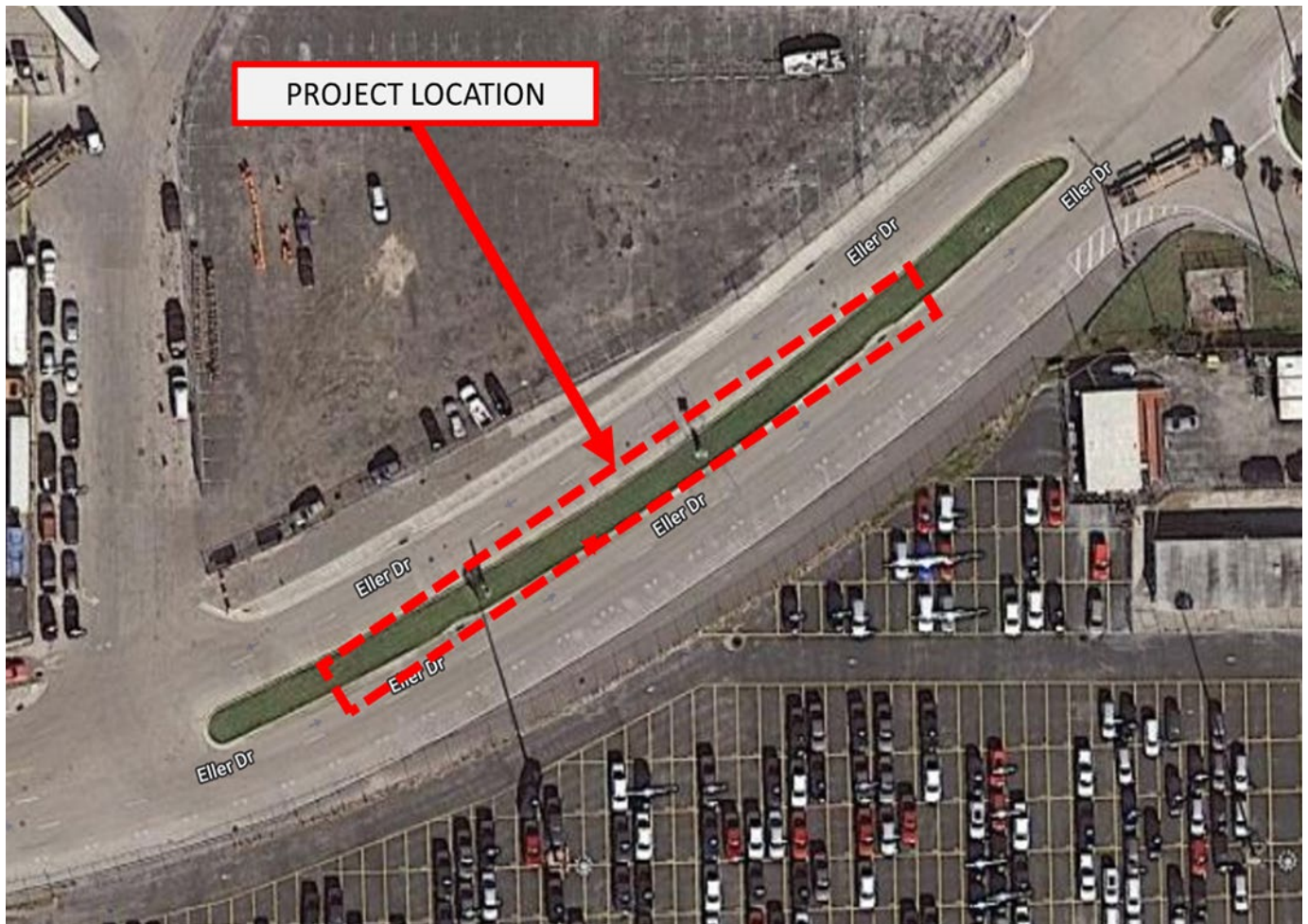
Aerial view of the site

The site for the artwork is a traffic median approximately 441.5 feet long by 18 feet wide, with a 2-foot concrete curb. A concrete control box and two wayfinding signs are installed within the existing median. The artist will need to take these objects into consideration. Artwork should not create a safety hazard by inviting public interaction or present a photo opportunity which requires cars to stop or pedestrians to cross roadways. Artwork will not interfere or block oncoming vehicular traffic.