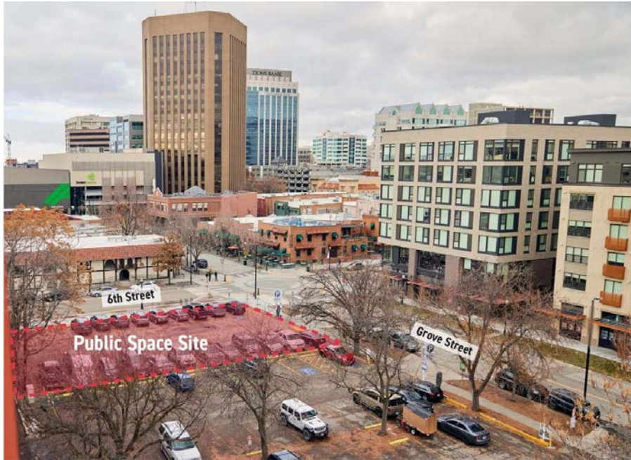
Future public site: 521 W Grove St. Boise, Idaho

The location for this project is 521 W Grove St., Boise, Idaho, in the Old Boise Blocks area (pictured above).