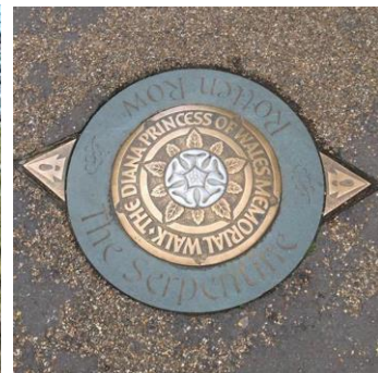
Examples of icons from Leucadia, CA, Tuscaloosa AL, London, England

The art element is intended to be 8" diameter and will be fabricated in 1/4 - 5/16" thick bronze with strokes no greater than 1/8". The selected artist work with the Department of Arts & History as they formalize the design, consult with the fabricator, and help ensure ADA compliance.