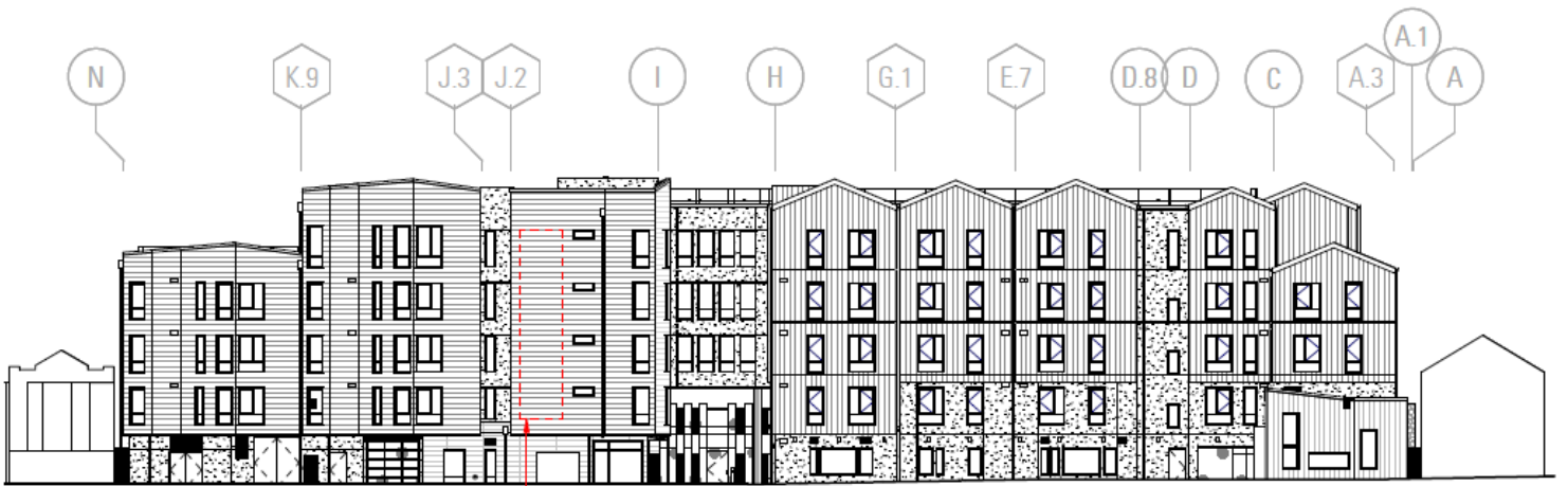
EXTERIOR ELEVATION - WEST - 43RD AVE 3/64" = 1'-0"