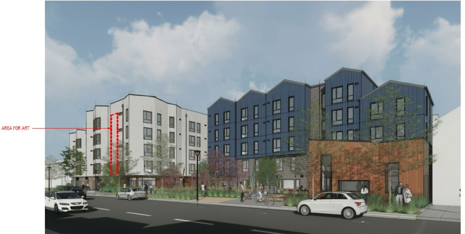
Renderings and Elevations Courtesy of BAR Architects