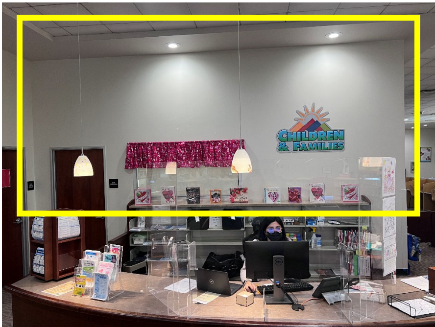
Figure 2. View of interior of Ovitt Community Library, youth section. Mural is to cover back wall (curtains, books and signage will be relocated.)