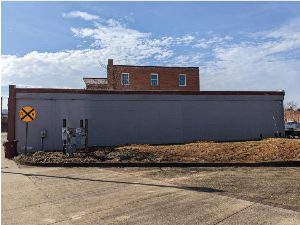
(Lower Wall Only)