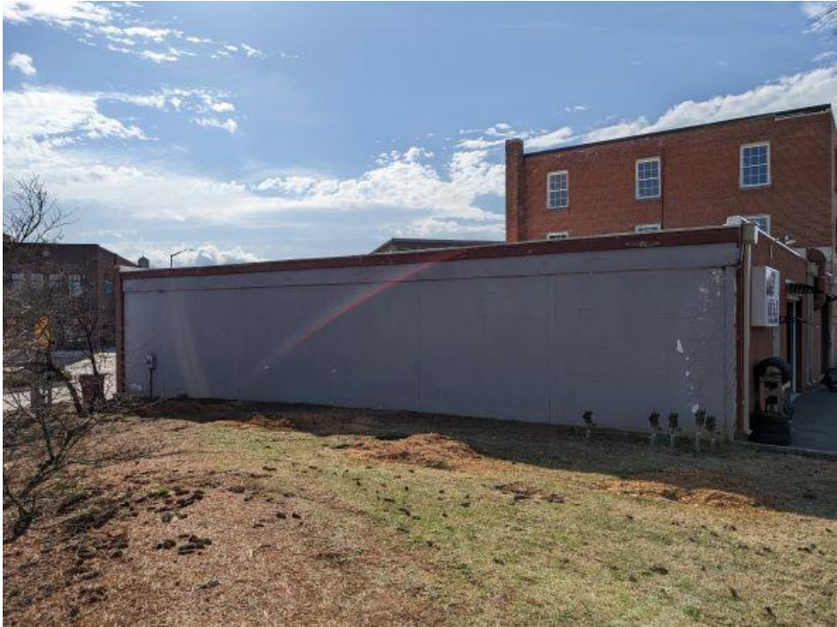
(Lower Wall Only)