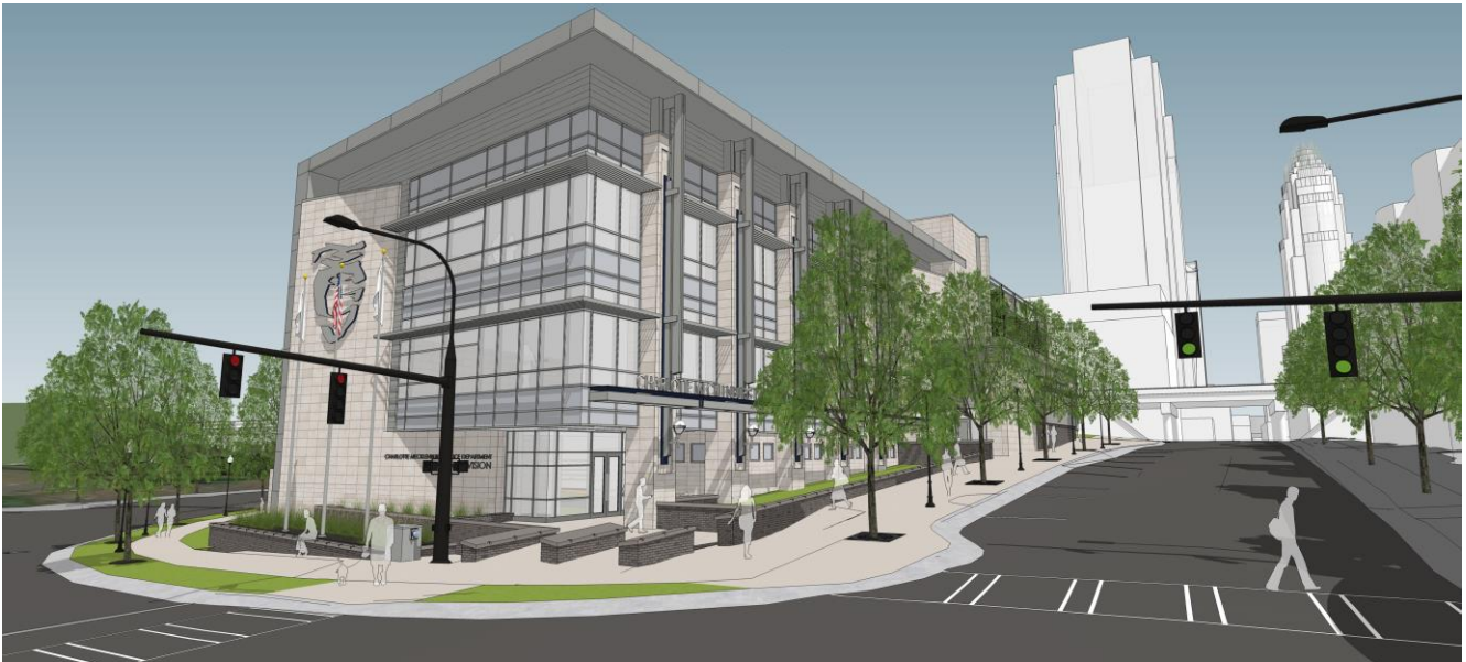
CMPD Central Division Station, architectural renderings provided by ADW Architects