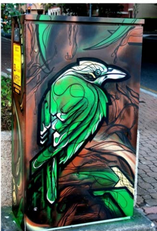
Artist - Tom Painter