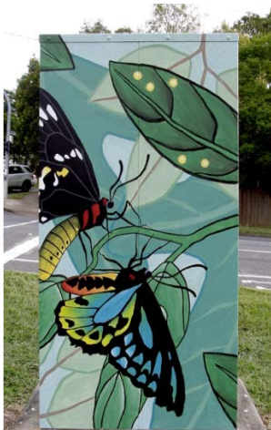
Artist - Jessica Fittock