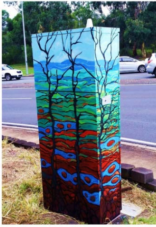
Artist - Wayne Smith