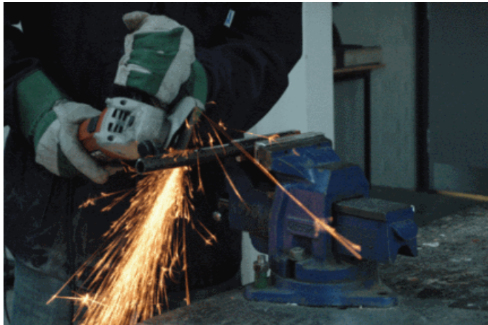
Grinding Hand Held Firearms for Decommissioning, tp Prepare for Transfer to the Foundry