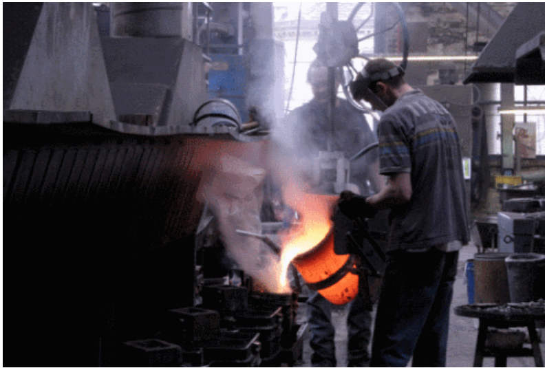
Pouring Molten Gun Metal into the Green Sand Moulds

Effectively, the project promotes a growing resistance and negativity towards gun culture by developing positive solutions for the recycling of gun metal into usable and symbolic commodities. The project is developing a number of concepts for manufacturing and commercial products that can be marketed to prospective buyers as a stand against gun crime. After decommissioning, the guns provide raw material for manufacturing processes, either by furnace smelting into molten metal or vaporisation into metal powder.