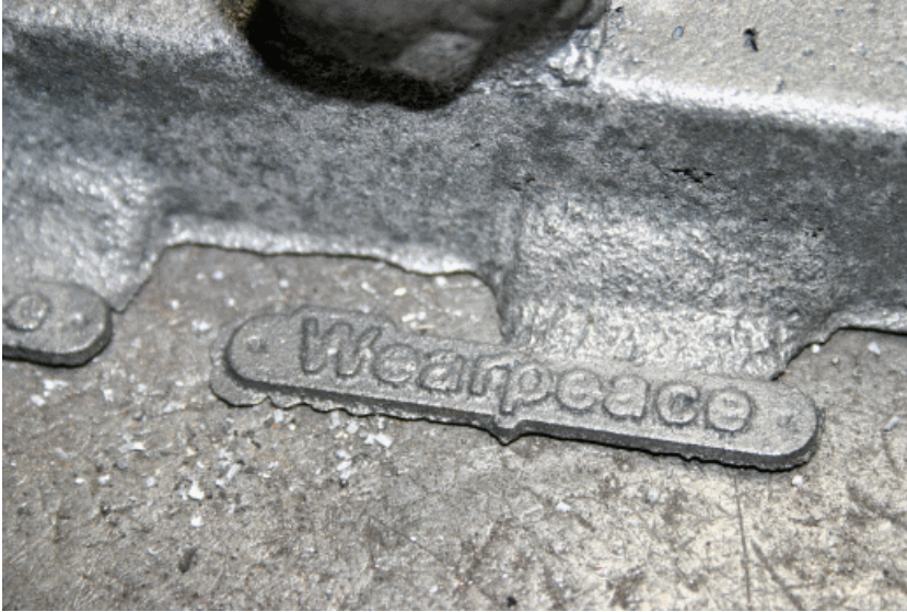
‘Wearpeace’ is one of the Brand Messages Devised through the ‘Guns to Goods’ Initiatives with CARISMA. The ‘Wearpeace’ logo Badge is made Entirely from Gun Metal taken from Gun Amnesties.