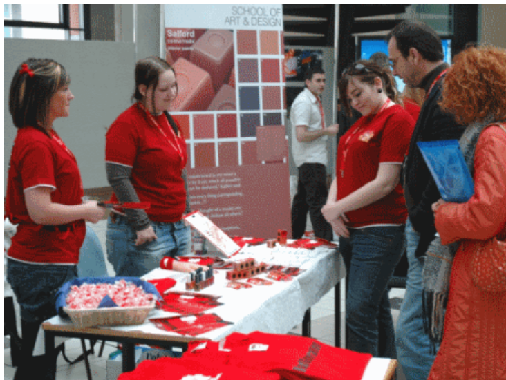
Year 11 Pupils Presenting REDGENERATION Products at an International Conference

purpose that bound them as a group and helped them to relate their activities to their families and wider friendship groups; that was that the area was changing rapidly through urban renewal planning and their activities found a voice within that process. Their ambitious goals were eventually constrained by time and the complexity of the task. Full production and commercialisation remained beyond the reach of the project. However, the group stayed together for 2 years and, in that time, exhibited their 'art' twice in public galleries and presented the whole project at the International Sociology Conference on Discourses, Power and Resistance in 2007. For the researchers and artists involved, the achievements of the young people in the project excited the possibility for the application of similar processes in comparable contexts. Current funding from the UK Arts and Humanities Research Council is enabling the team to test and refine a model or method of practice for transfer to public and third sector partners.