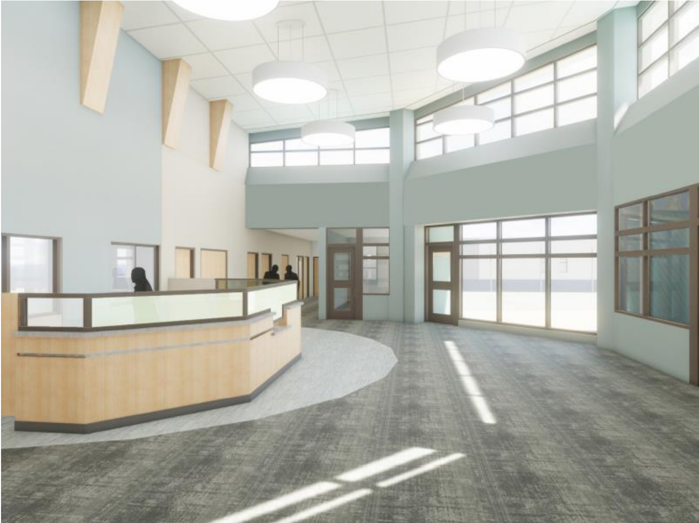
Day room, Hawkins Building addition