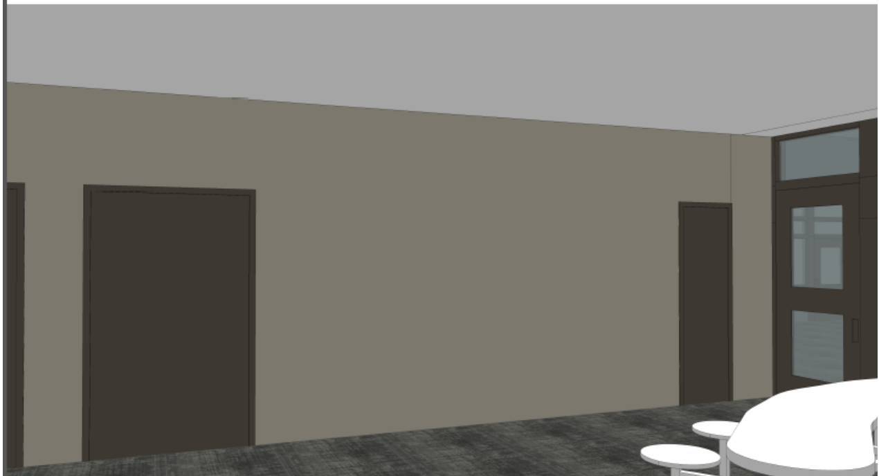
Quiet living area, Hawkins Building addition, high-security wing