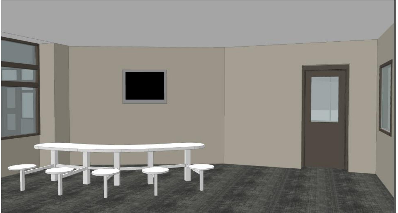
Quiet living area, above perspective, Hawkins Building addition, high-security wing