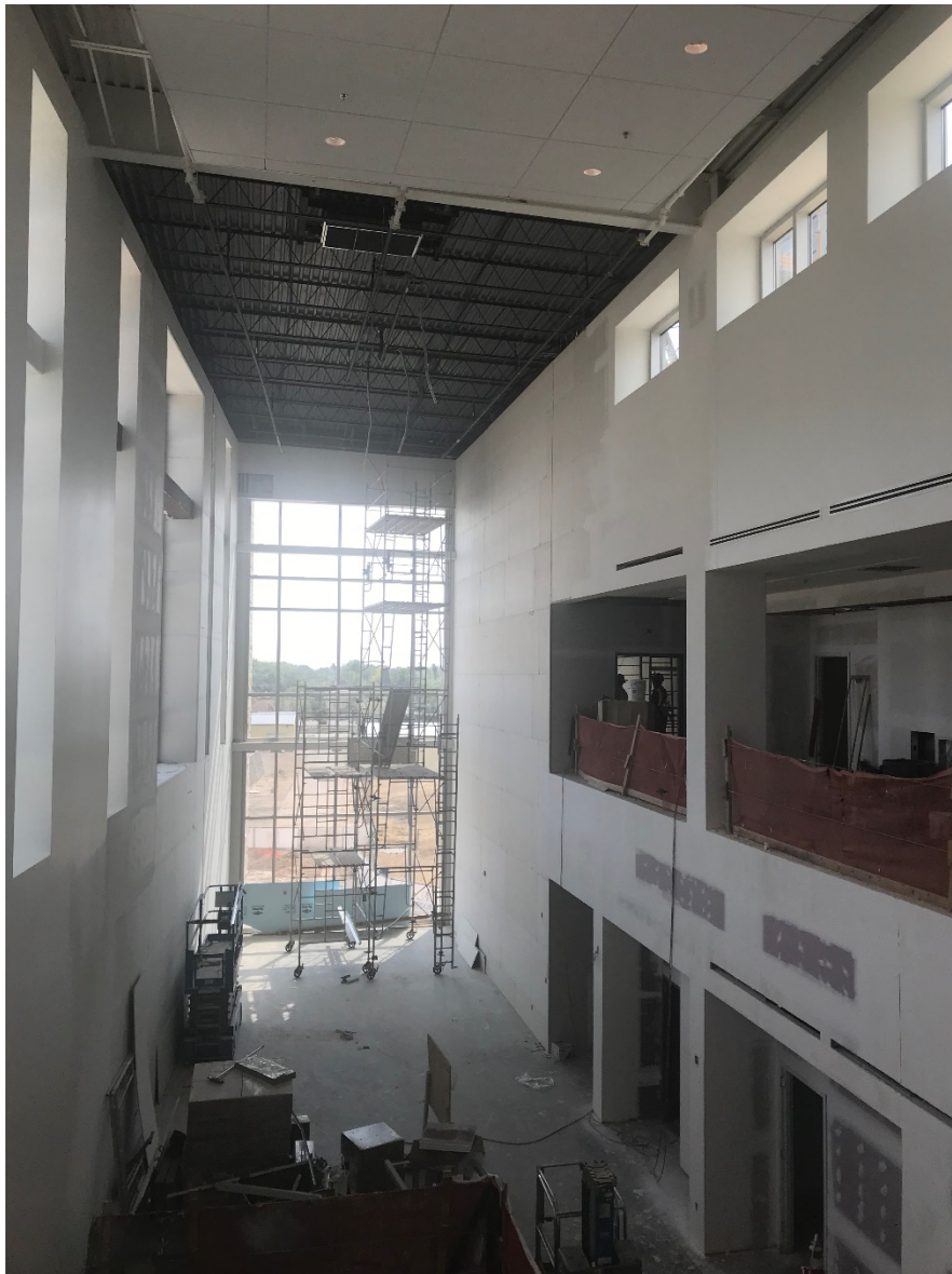
Translational Medicine Institute, artwork location (back right), construction of space, as of 8/1/18