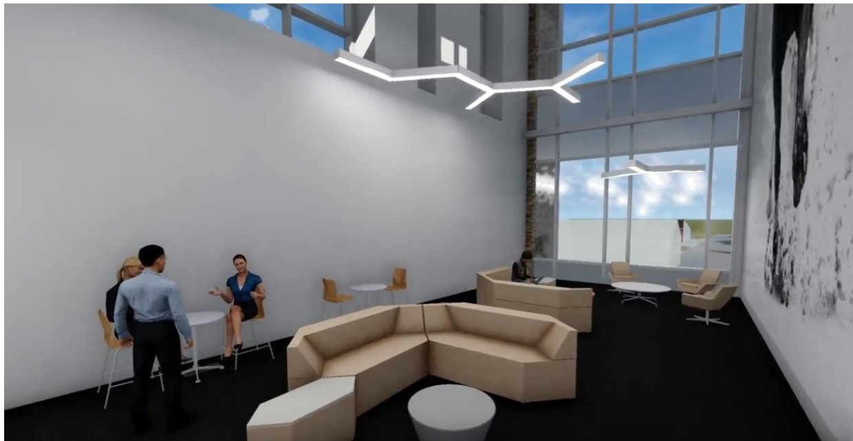
Translational Medicine Institute, artwork location (vertical wall on right), rendering