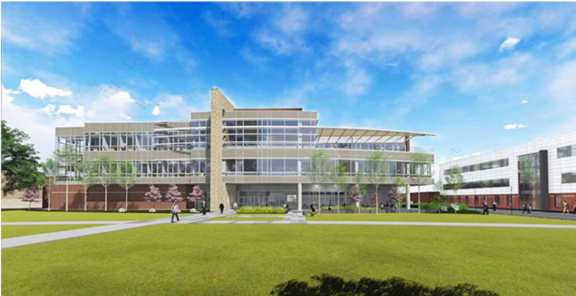
Translational Medicine Institute, rendering

Qualifications are requested from artists interested in creating a site-specific interior public artwork for the Translational Medicine Institute, part of Colorado State University's College of Veterinary Medicine and Biomedical Sciences. This opportunity is open to Colorado artists only.