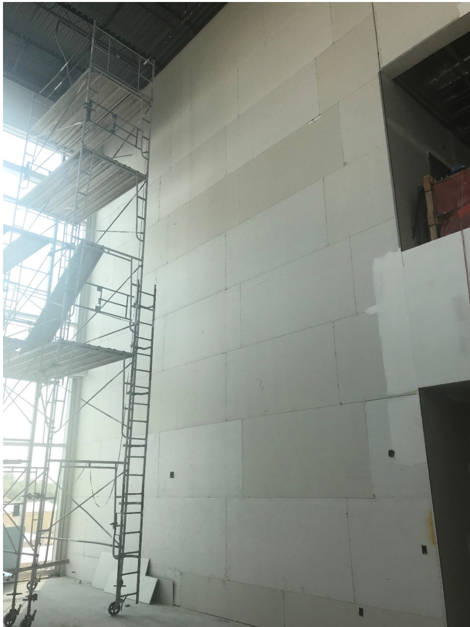
Translational Medicine Institute, artwork location, detail of construction, as of 8/1/18