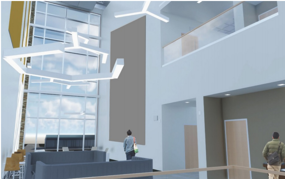
Translational Medicine Institute, artwork location (vertical wall in center), rendering