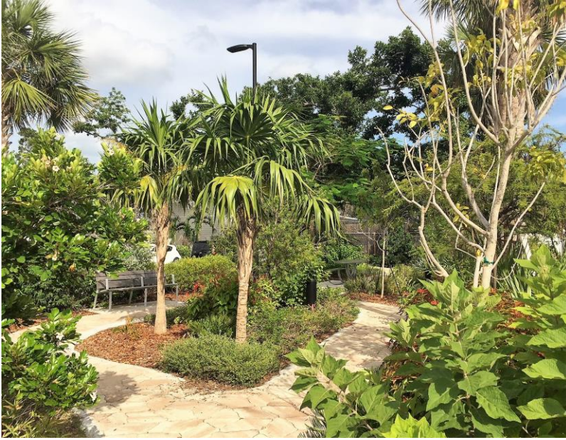
Figure 6 - #3 – Rear Butterfly garden

Please note: All proposed exterior artwork may not impact existing trees, palms, shrubs or groundcover. CKW Urban Forester will coordinate project.