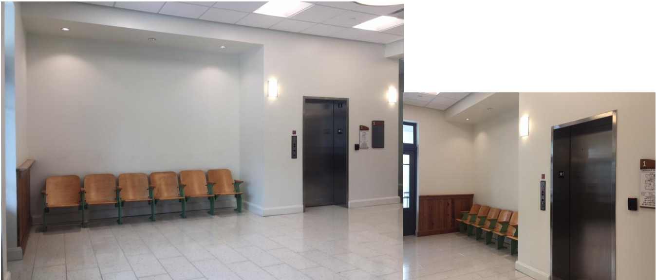
Figure 2 and 3 - # 4. Front Lobby – above chairs