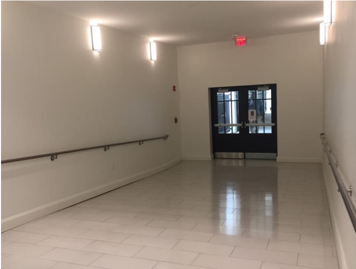
Figure 4 #5. Walkway walls (to the left of the Commission Chambers)