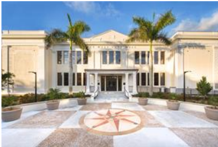
Figure 1 # 1. Front Entrance - retaining wall