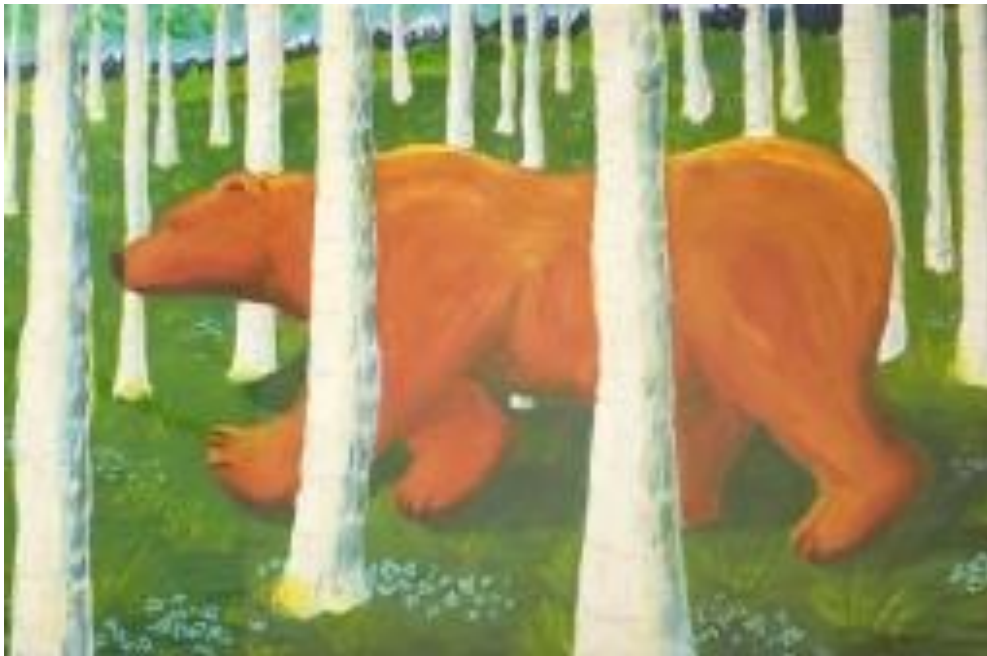
Washington State Governor Inslee's original oil pastel on paper, Bear With Me.

A few months ago, the National Governors Association (NGA) reached out to Americans for the Arts to see if we would partner with them in a very unique way. Washington State Governor Jay Inslee, who is a respectable amateur painter and NGA wanted to highlight the value of arts education by auctioning off an original piece of artwork by the Governor. At their Santa Fe, NM meeting, Governor Inslee unveiled the painting, Bear With Me. NGA designated Americans for the Arts to receive the proceeds from the auction to "build recognition and support for the extraordinary and dynamic value of the arts and to lead, serve, and advance the diverse networks of organizations and individuals who cultivate the arts in America." If you would like to make a bid, go here .