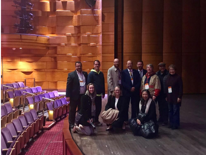
A group of legislators pose for a photo at the Terrace Stage at the Kennedy Center.