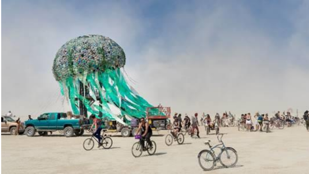
"The Blob," an example of one of many pieces of temporary public art that are erected at Burning Man.

Coming up: Americans for the Arts will host the Mayor's Arts Breakfast at the USCM's Winter meeting in Washington, DC January 25, 2019.