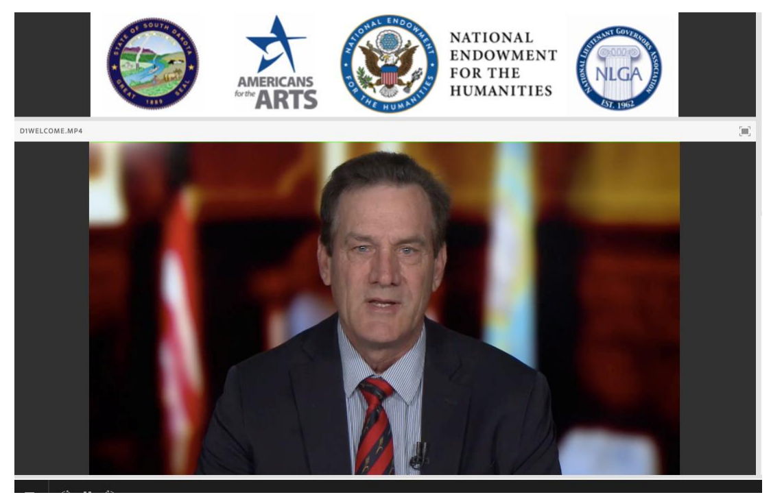
South Dakota Lt. Governor Larry Rhoden welcomes the group virtually to the summit.

Our last summit was originally scheduled for April but was postponed. After our hopes for an in person summit collapsed, we arranged for an virtual conference in November.